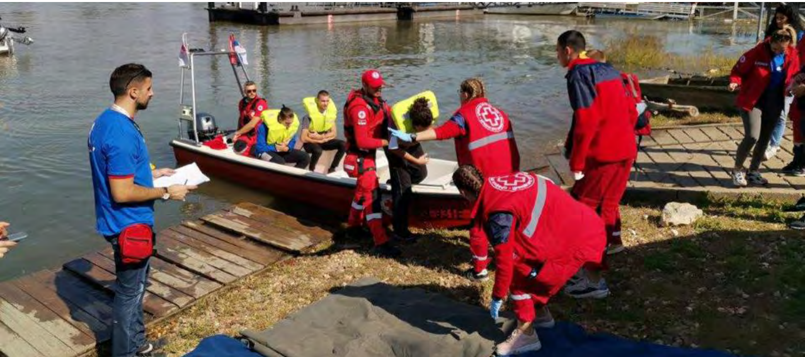
Following torrential rains and severe flooding in Serbia, the Red Cross of Serbia supported 2,700 people and over 500 households with evacuation, relief aid, disinfection, and dehumidification

The IFRC provides financial and technical assistance for emergency response mechanisms. IFRC mechanisms such as the disaster response emergency fund (DREF) and the IFRC Emergency Appeal are utilized by the National Society in times of disasters and crises to effectively support those who face immediate needs during times of emergency.