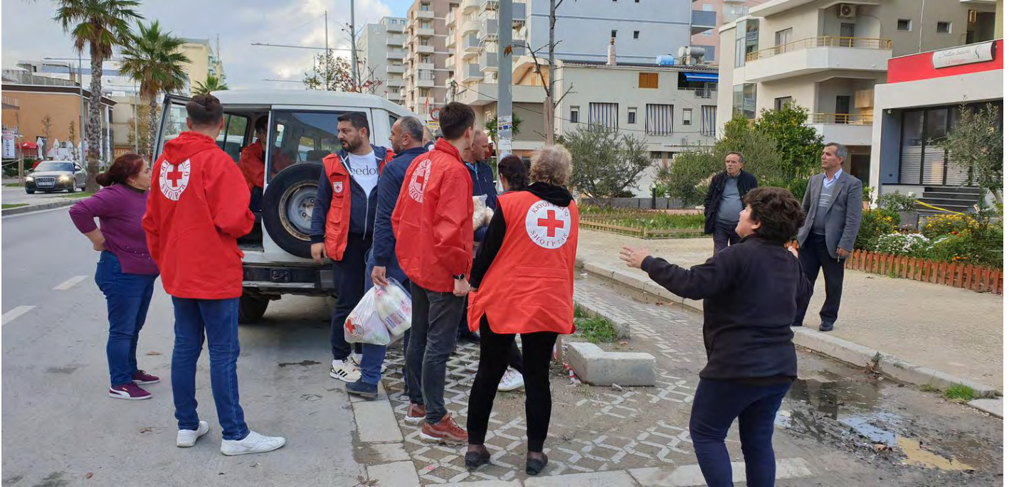
Following an earthquake in Durrës, Albania, Red Cross teams delivered food and psychosocial support to displaced families sheltering in cars and unable to return to their homes

The IFRC provides long-term support to the Albanian Red Cross in addressing the needs of migrants, refugees, and asylum seekers and it collaborates with the National Society to aid those affected and advocate for their rights and well-being.