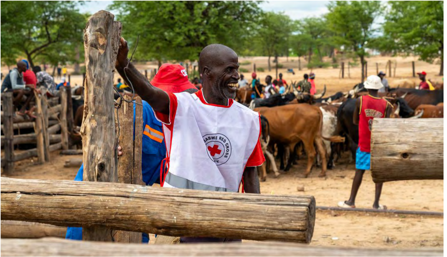
The Zimbabwe Red Cross Society assisted local authorities in the dipping and dosing exercise of cattle.

The ICRC provides support to the National Society under the Restoring Family Links (RFL) initiative.