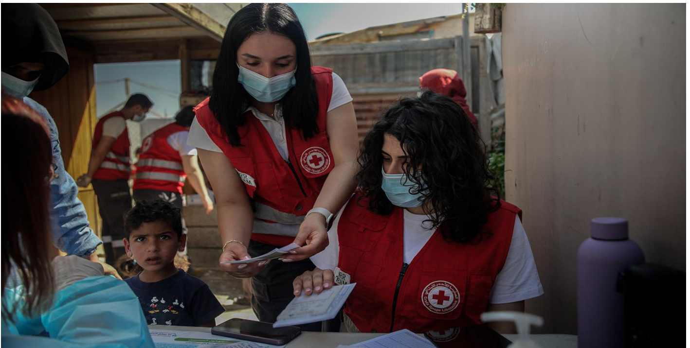
The Lebanese Red Cross carried out Gavi routine childhood vaccinations for vulnerable children in Lebanon

Community engagement and accountability (CEA): Mainstreaming community engagement and accountability approaches; building on the well-functioning 1760 hotlines and established mechanisms to collect, respond to and use community feedback.