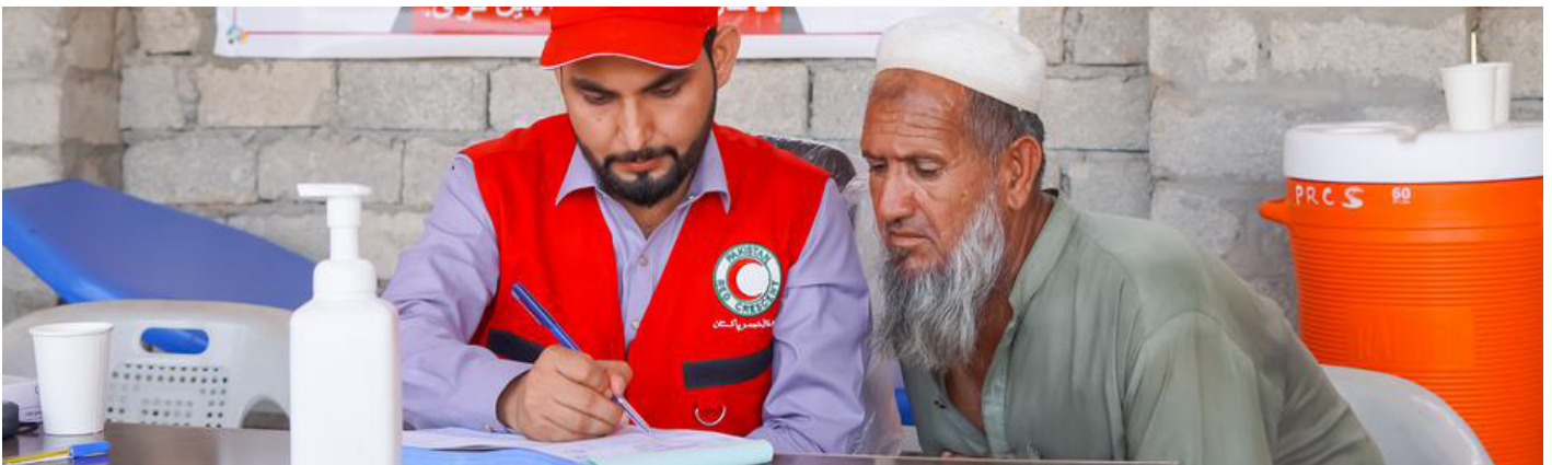
Teams of the Pakistan Red Crescent providing support services such as health, ambulance, psychosocial support and WASH to Afghan returnees at a Humanitarian Service Point

The Norwegian Red Cross provided support to the National Society in the provision of primary health care, psychosocial and maternal services, health awareness and humanitarian response.