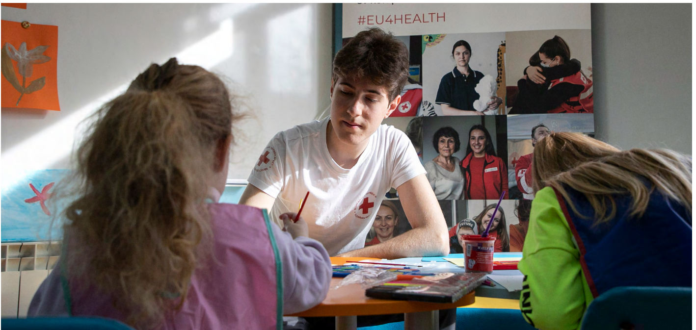
The Bulgarian Red Cross' EU4Health project provided art therapy, child-friendly spaces and support groups to help adults and children displaced from Ukraine.

In this reporting period, no changes or amendments were made by the National Society