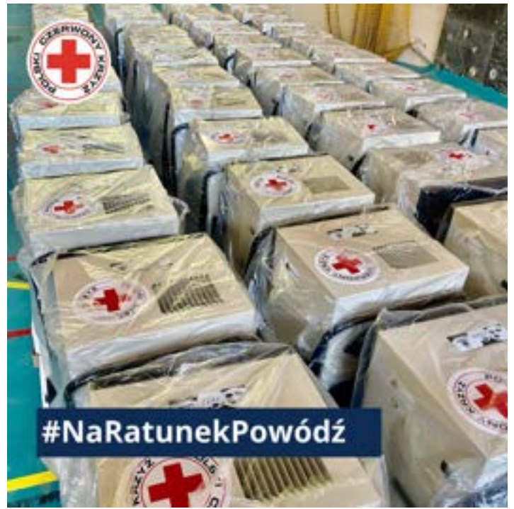
Distribution of dehumidifiers to affected communities, Source: PRC