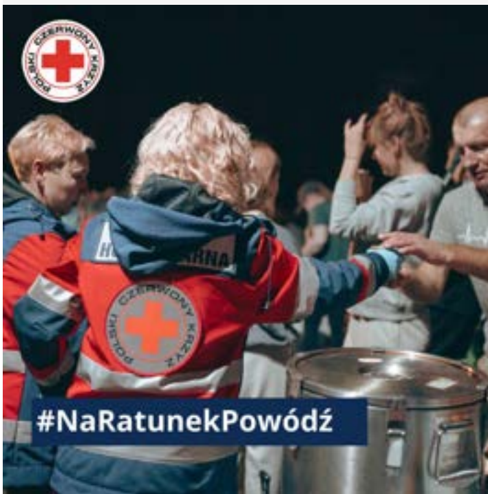
Provision of fresh meals to affected communities