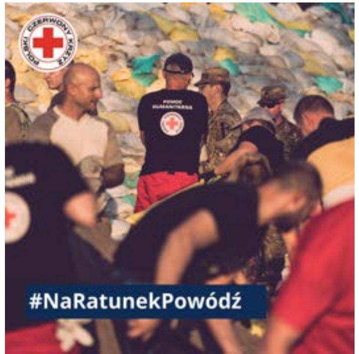
PRC provide support for cleaning.