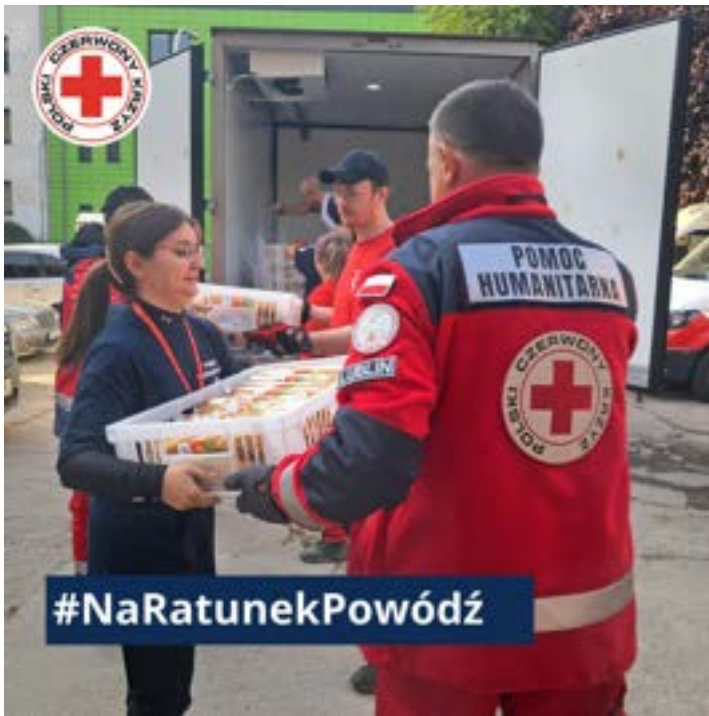
Distribution of food items by PRC volunteers.