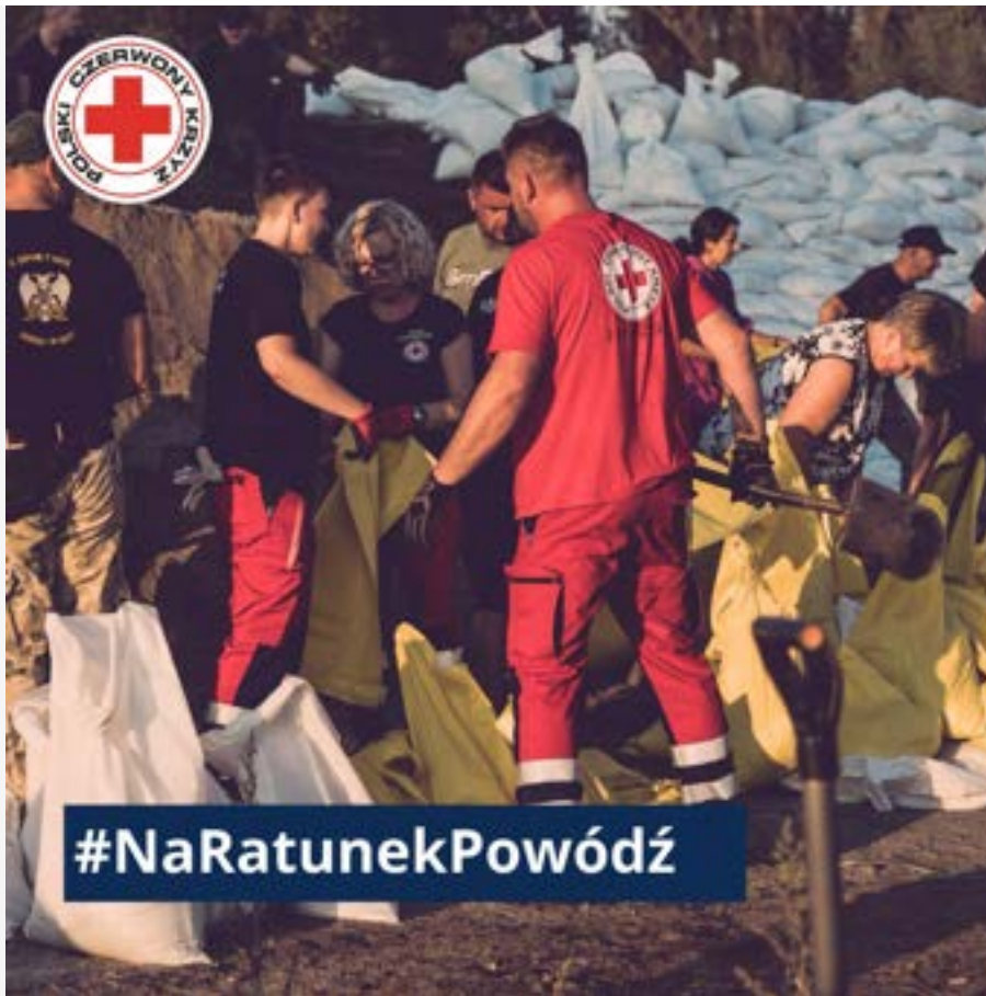
Polish Red Cross (PRC) staff and volunteers work tirelessly to strengthen a dike in a flood-affected region during the devastating September 2024 floods.