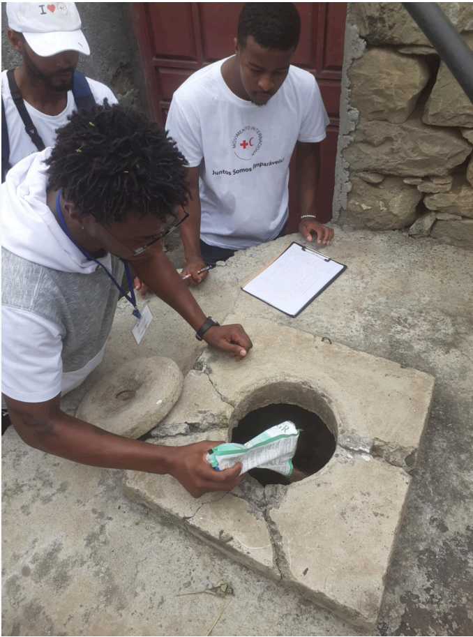
Water tank desinfection campaign