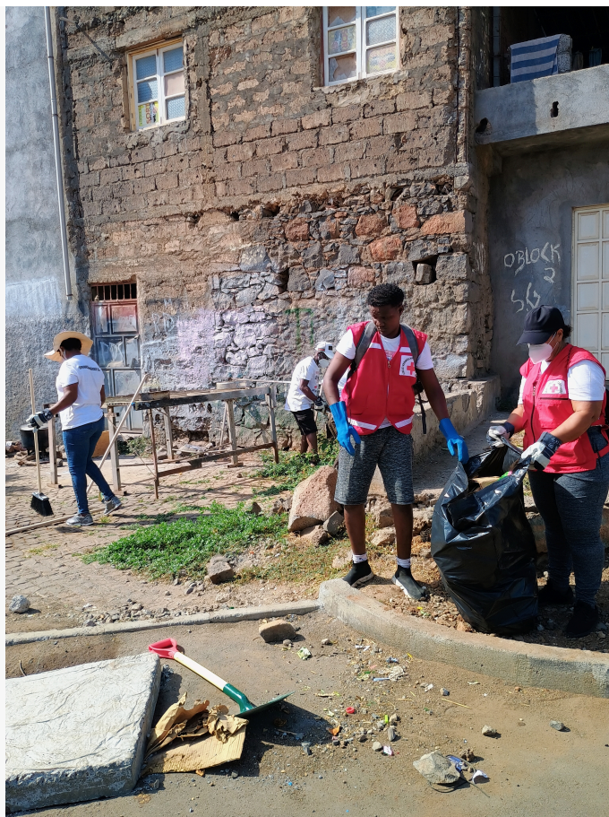
Clean-up campaign in a Capital community