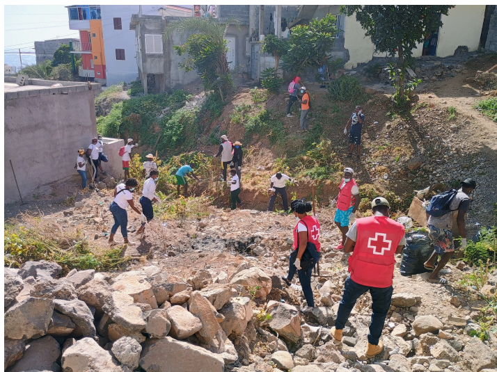
Community clean-up in Santa Cruz

312 trained volunteers are carrying out a major awareness-raising, community mobilization and clean-up campaign. Despite this, combined with the efforts of the authorities, the number of cases continued to rise, as did the number of people who died. As of December 22, 2024, the country had a total of 26,873 suspected cases, of which 18,208 were confirmed, and 8 deaths.