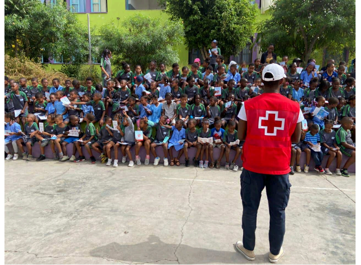
Raising awareness in a school