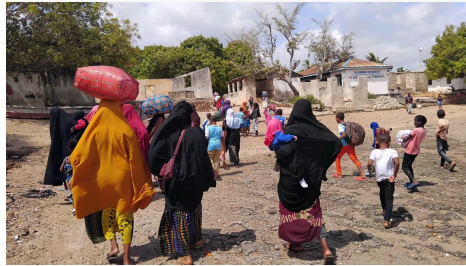
Women & Children arriving in Lamu, Kiunga