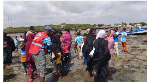
Families being received by KRCS personnel