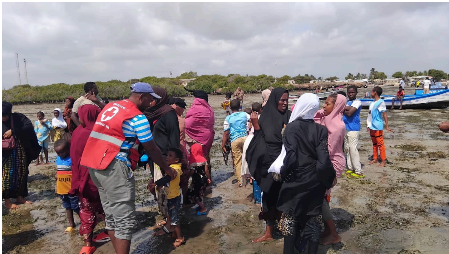
Kenya Red Cross Society staff receiving refugees and returnees into Kenya.