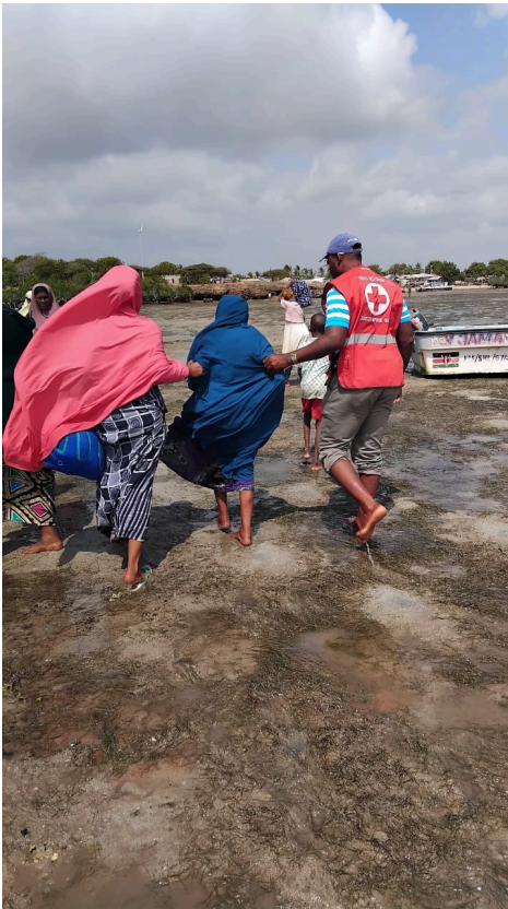
Women being helped by KRCS teams