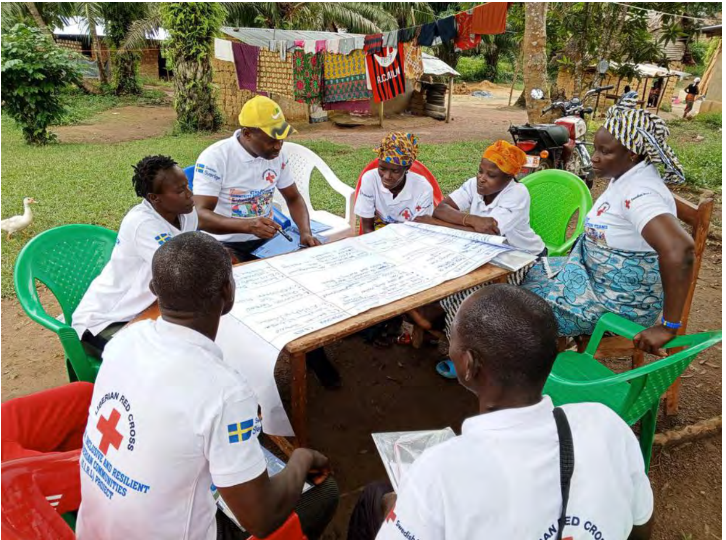
Liberian Red Cross conducted a training on Community Early Warning Systems, training participants from Flewroken, Sarbo Geeken, Matuaken, and Podroken

The IFRC provided the Somali Red Crescent Society with technical and financial assistance for its activities.