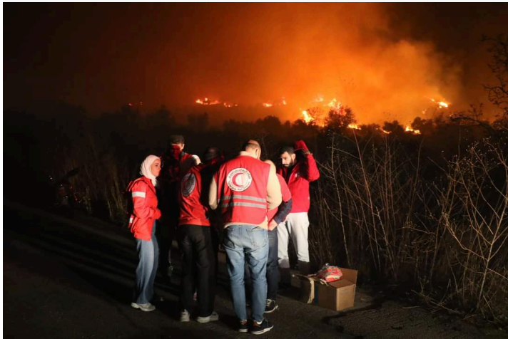
SARC Teams responding to the wildfires.