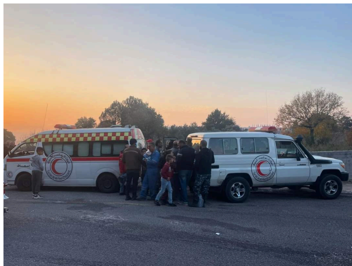
SARC Teams supporting people affected by the wildfires.