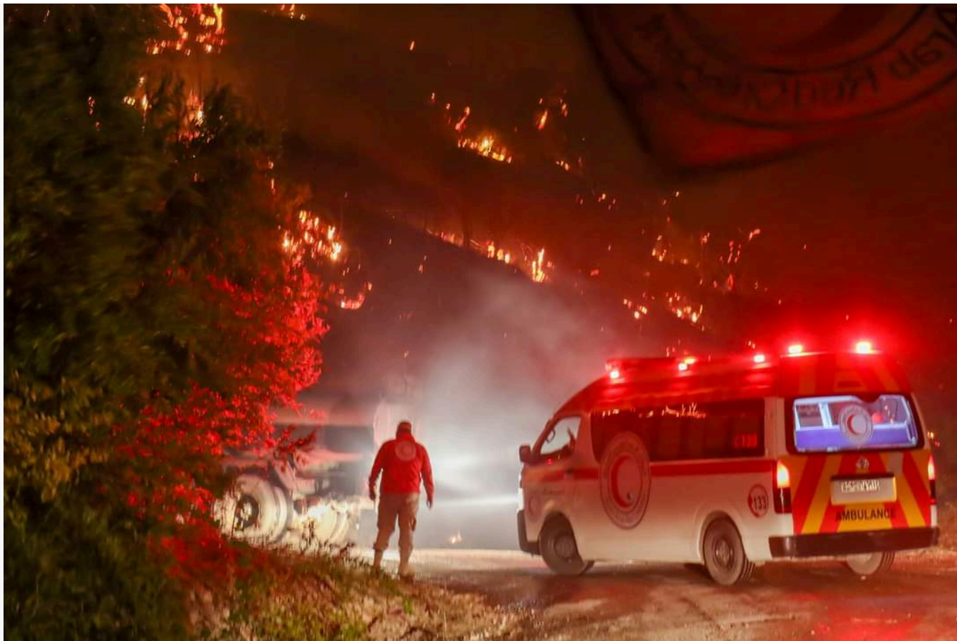
SARC Volunteers responding to the areas affected by the wildfires.