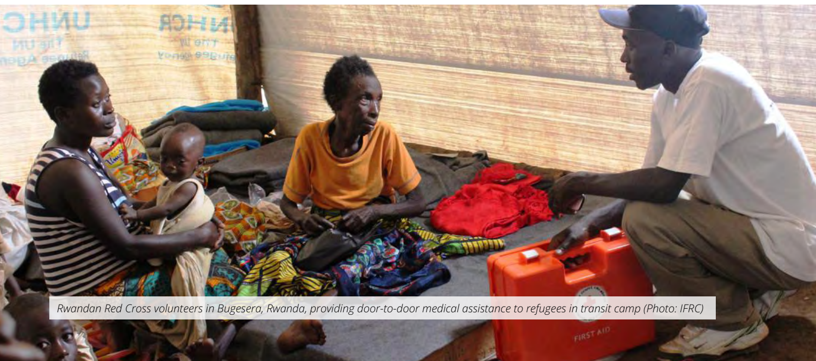
Rwandan Red Cross volunteers in Bugesera, Rwanda, providing door-to-door medical assistance to refugees in transit camp

The IFRC will assist the Rwandan Red Cross in increasing its fundraising at the national level by developing tailored strategies. In addition, the IFRC is also establishing long-term relationships with potential donors to ensure sustained support for the National Society.