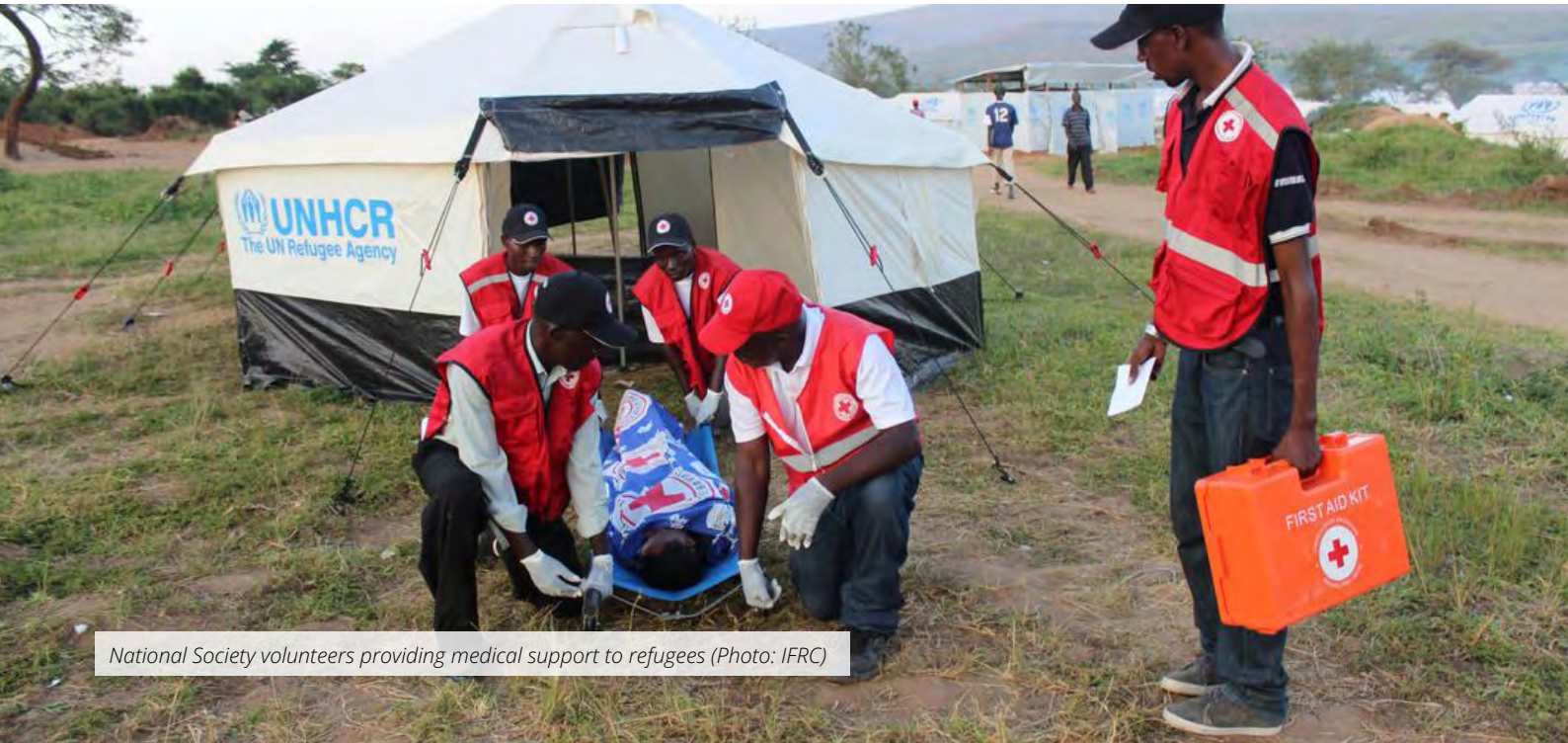
National Society volunteers providing medical support to refugees