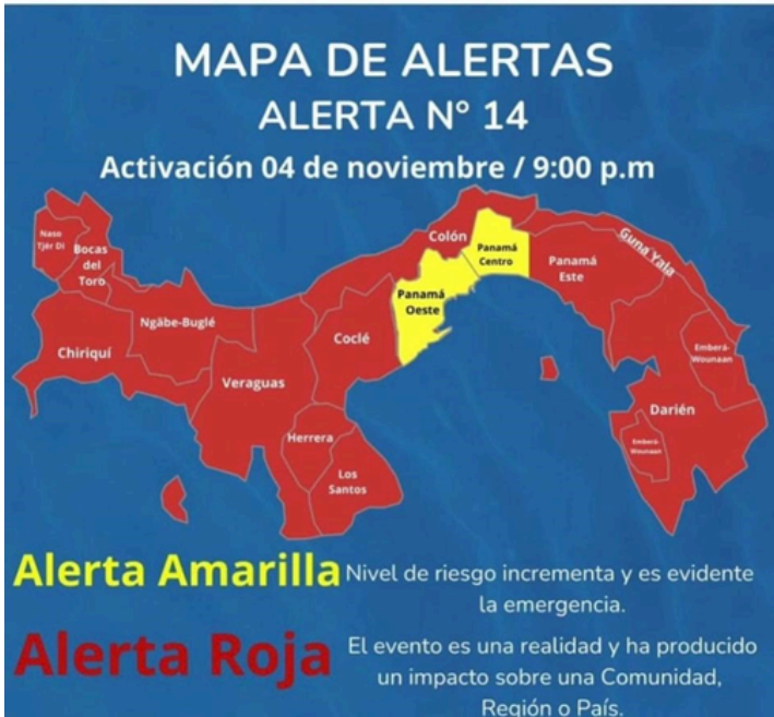
Alert Map, 4 November 2024.