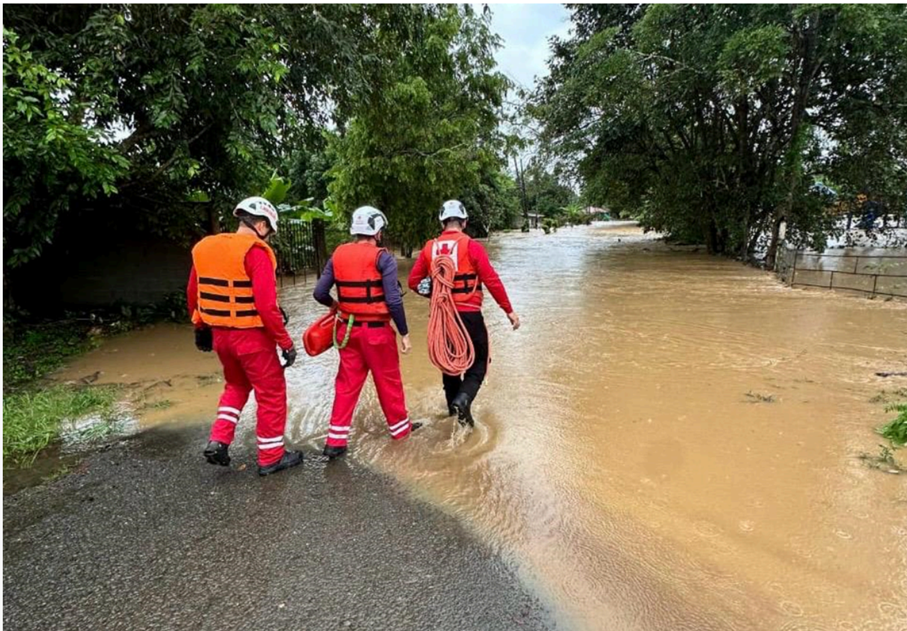
Evacuation operations in Tonosí by the Red Cross Society of Panama (3 November 2024).