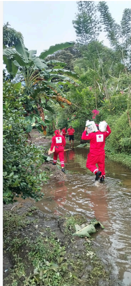
Volunteers during needs assessments in Los Santos province. November 2024.