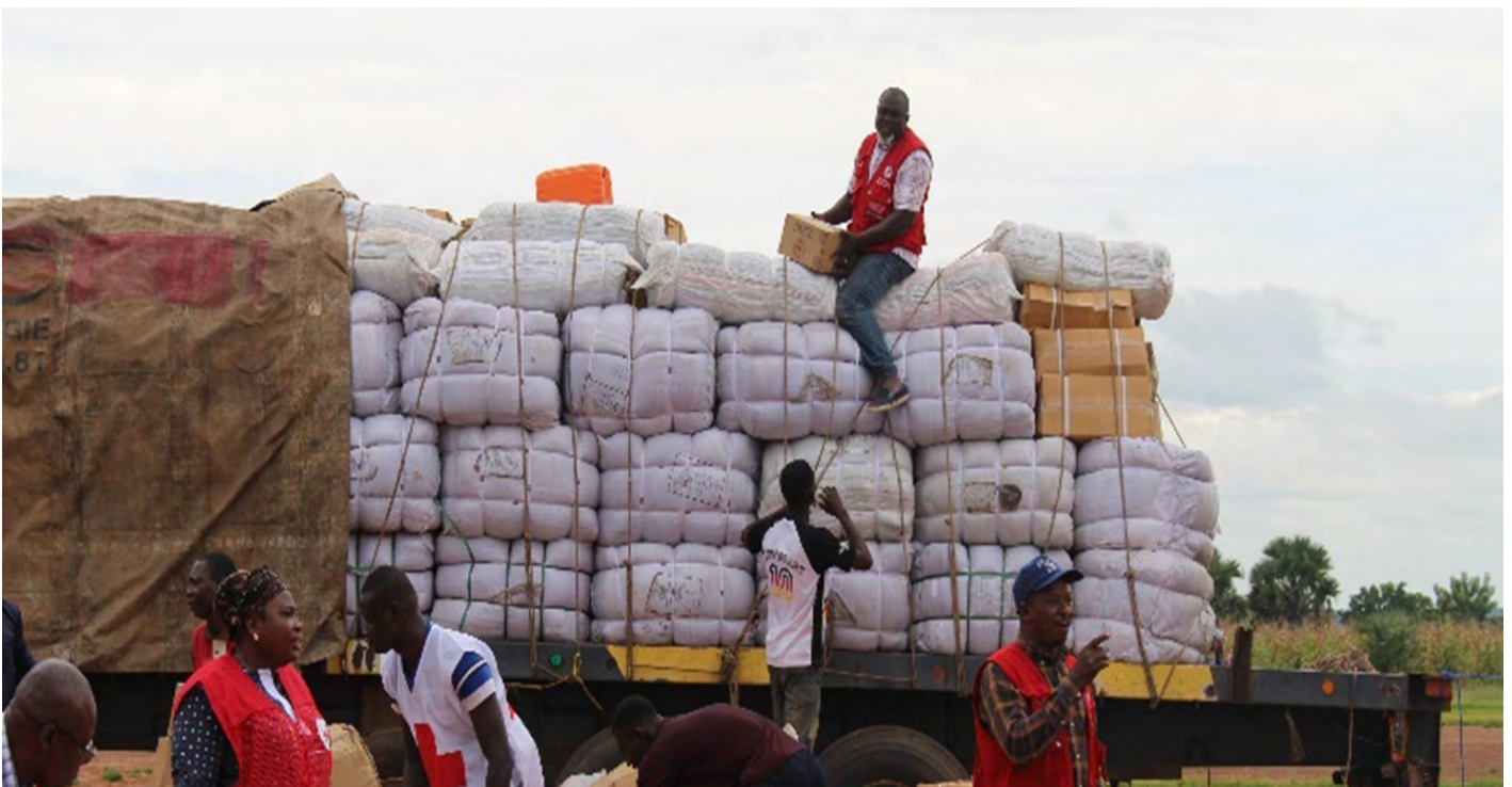
Delivery of assistance to people affected by disasters in Togo.

The Swiss Red Cross funded and supported the 'Strengthening Community Resilience' in the Plateaux and Central regions, the 'Eye Health' project in the Plateaux, Central and Kara regions, the 'Blood Transfusion' project in the Central Region and the 'Promotion of the Health and Social Inclusion of the Elderly' project in the prefecture of Golfe in Grand-Lomé.