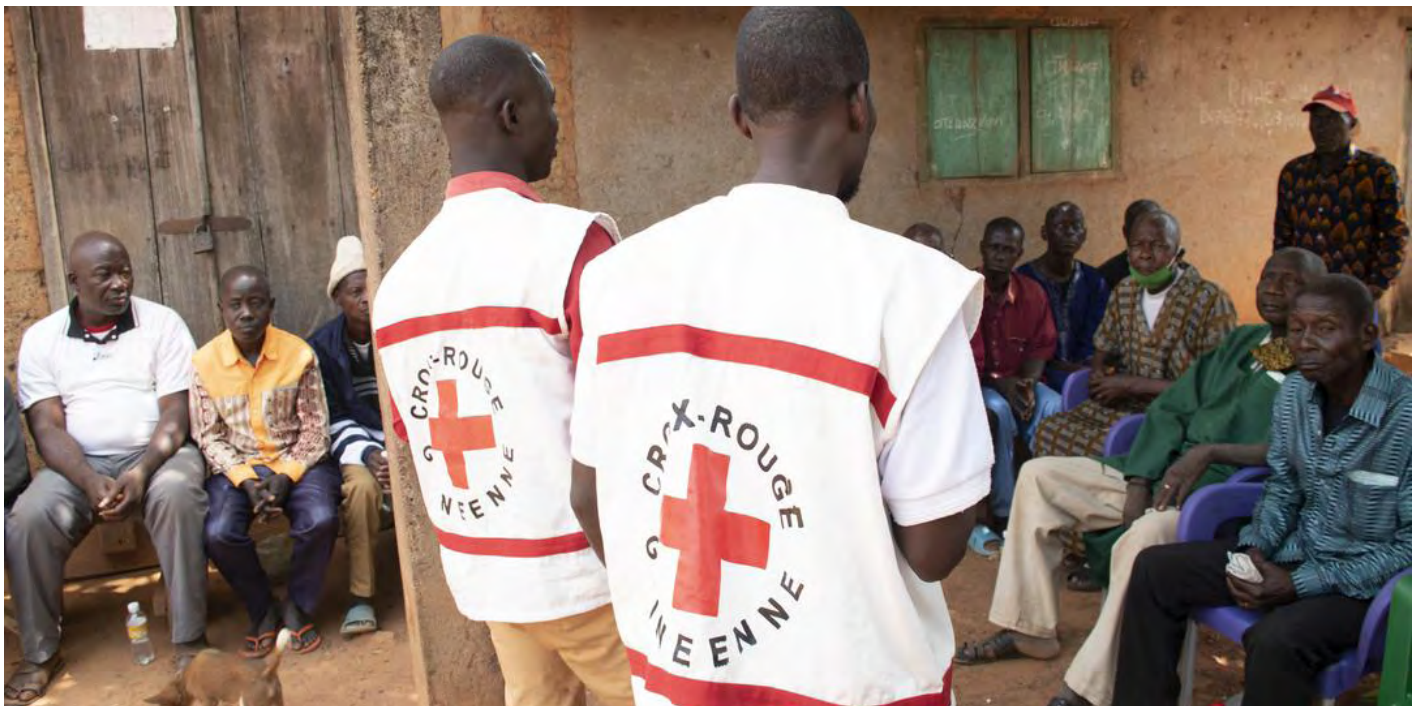
Session of sensibilization conducted in Faranah region, by Red Cross volunteers among communities to increase COVID-19 vaccine acceptance.

The IFRC supports for the training of the SBC NYSS tool and assists in the production of audio-visual materials.