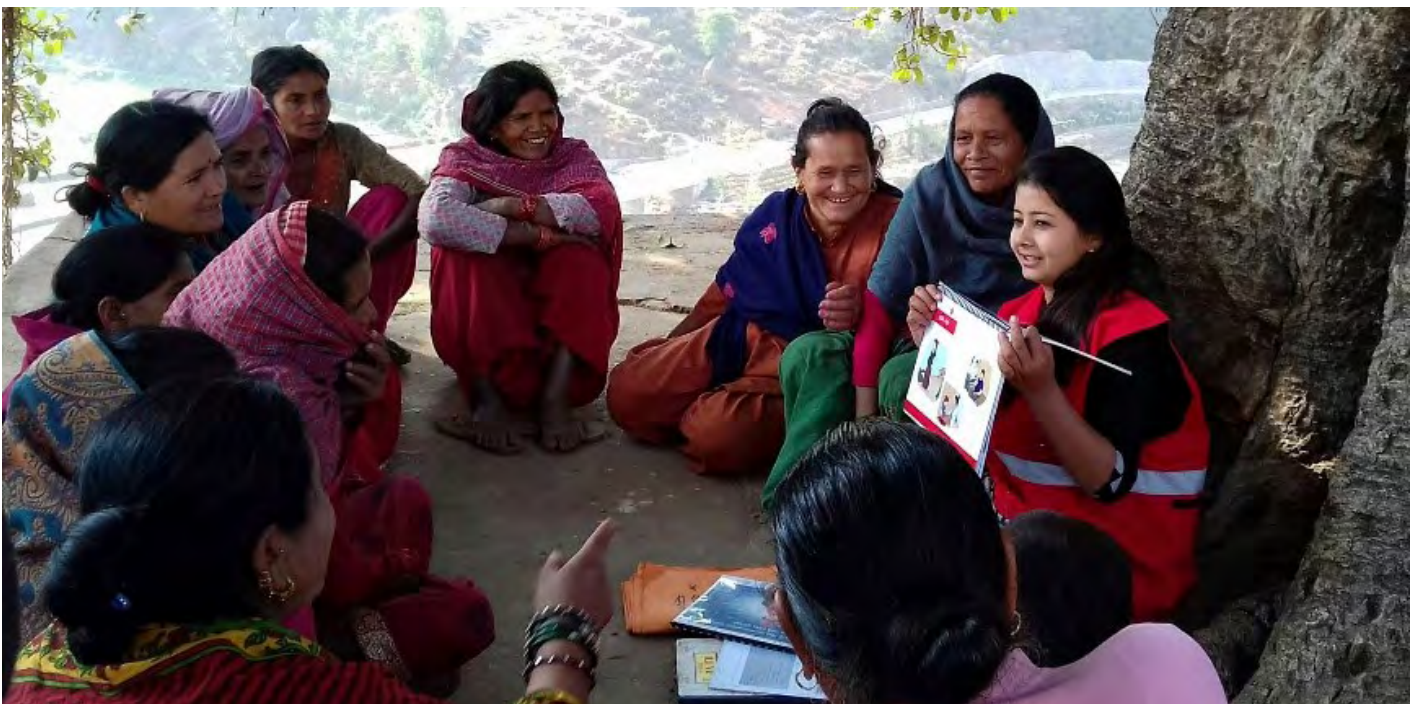
Nepal Red Cross Society continues to reach communities with health promotion messages.

The IFRC supported the Nepal Red Cross Society in its efforts to provide immediate humanitarian relief assistance to those affected by the 2023 earthquake. This support included the provision of emergency shelter items, cash assistance, WASH and protection and PGI interventions.