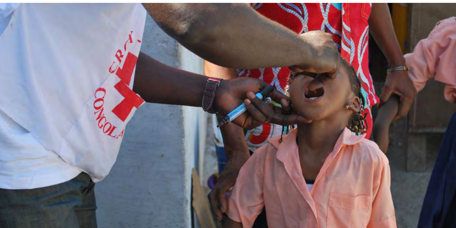
Congolese Red Cross helping in the Polio Vaccine drive. April 2021

The ICRC supports the Congolese Red Cross under a three-year cooperation agreement, implemented through an annual cooperation action plan focusing on crisis management preparedness, restoring family links and capacity building. The activities within the partnership are focused on six priority areas: Brazzaville, Plateaux, Pool, Bouenza, Likouala and Pointe-Noire.