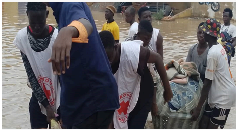
Floods in Bla 22 July 2024

Tragically, the floods have led to the loss of 28 lives, highlighting the urgent need for effective response measures to address the ongoing crisis.