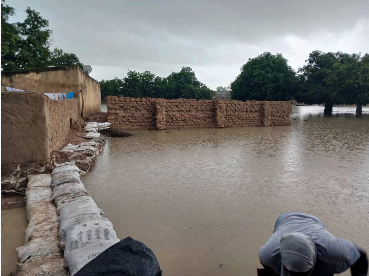
Floods in Bla-22 July 2024