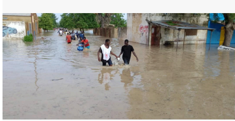
Floods in Bla 22 July 2024