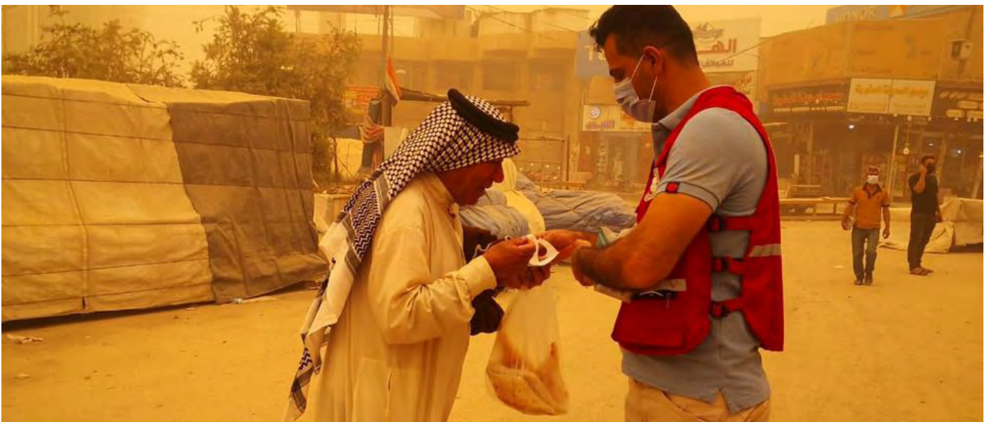
Iraqi Red Crescent volunteers providing masks in public and providing health services and advice for the people affected by storm.

The IFRC provides both financial and technical support to the Iraqi Red Crescent Society for its activities outlined under health and wellbeing. This support consists of amplifying and enhancing the National Society's objectives such as building the capacity of local communities on community-based health and first aid ( CBHFA ), community-based surveillance, WASH interventions, among a range of other healthcare services.