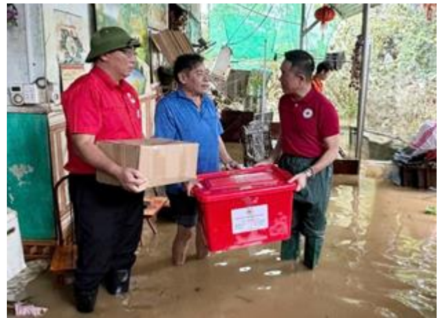
VNRC Vice President/Secretary General handing a household kit to affected household in Phu Tho province.

VNRC initially requested an IFRC Disaster Response Emergency Fund (DREF) allocation to support 50,000 people in four impacted provinces with conditional cash assistance for livelihoods, replenishment of distributed relief kits, food and nutrition assistance, water, sanitation, and hygiene (WASH) and health interventions. With the rapidly growing impact, an EA was later launched on 18 September 2024 with a funding ask for CHF 4 million to broaden the reach and impact of the operations to 130,000 people in seven impacted provinces.