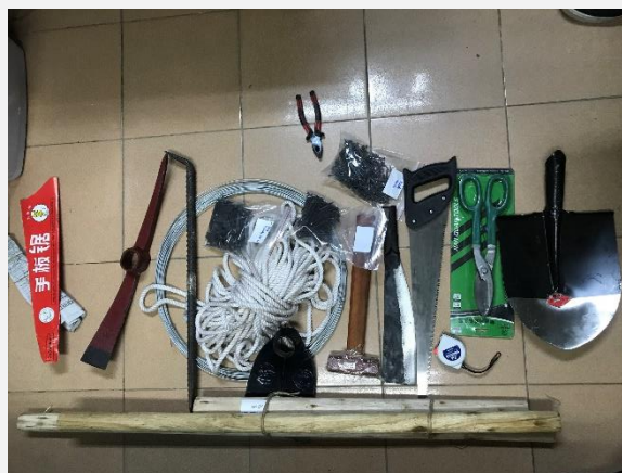
Items in the repair kit