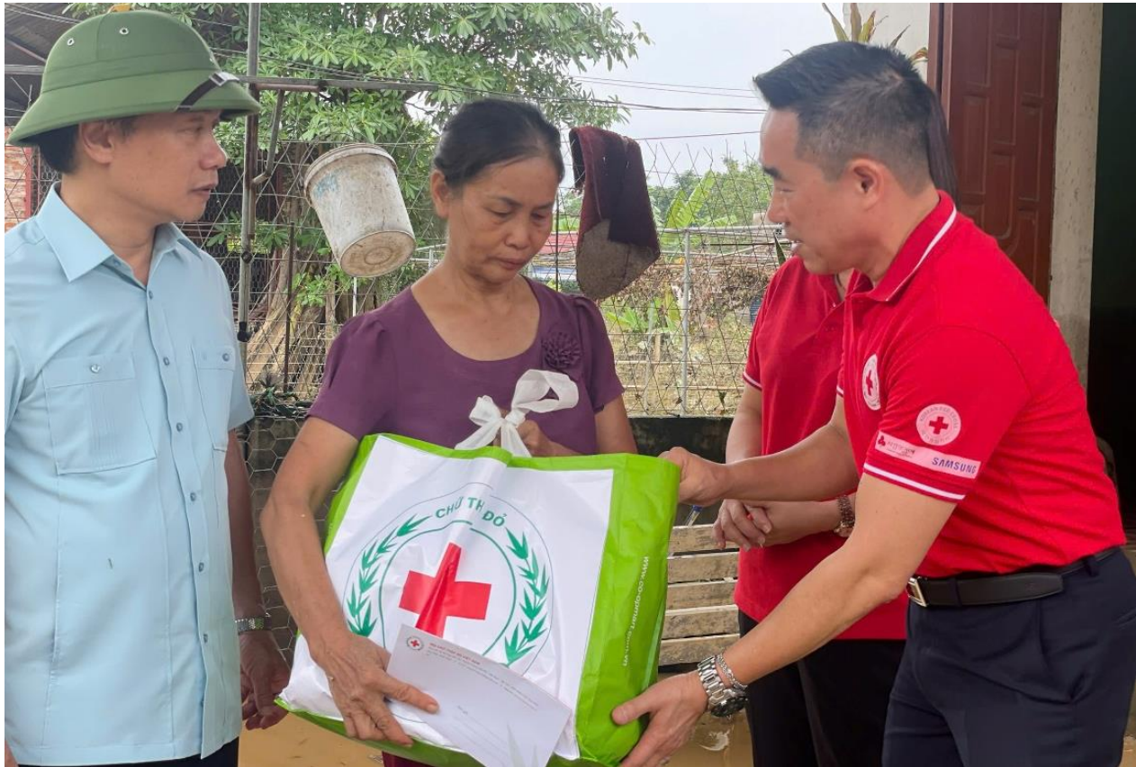
VNRC delivering household items to affected family in Phu Binh district of Thai Nguyen province, one of the provinces heavily impacted by Typhoon Yagi.

To date, this Emergency Appeal, which seeks CHF 4,000,000, is 51 per cent funded. Further funding contributions are needed to enable the Viet Nam Red Cross Society (VNRC), with the support of the IFRC, to continue with the response efforts and provide humanitarian assistance to people affected by Typhoon Yagi and its aftermath.