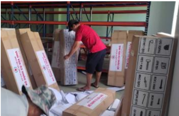
VNRC staff preparing home repair kits for distribution in Lao Cai province.