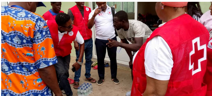
The representative of the beneficiaries discussing how they will share the food between women and men