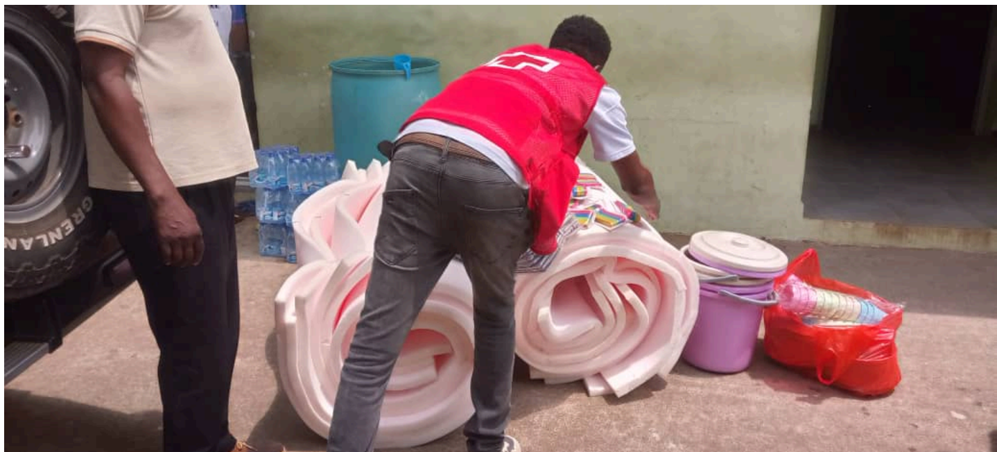
Red Cross of Equatorial Guinea volunteers distributing sleeping materials to rescued passengers following the shipwreck in Bata