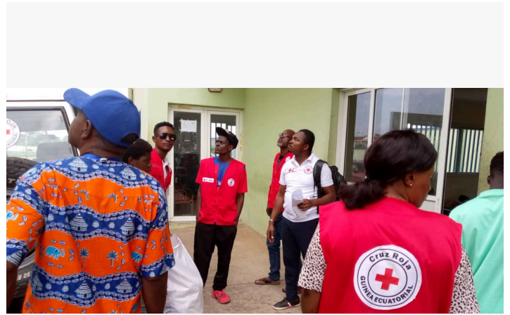
Distribution of hot meals to affected people in Bata