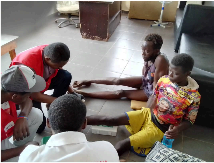
Provision of first aid services to shipwreck affected people in Bata, Equatorial Guinea