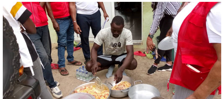
The representative of the beneficiaries shares the food in 2 parts (for women and men)