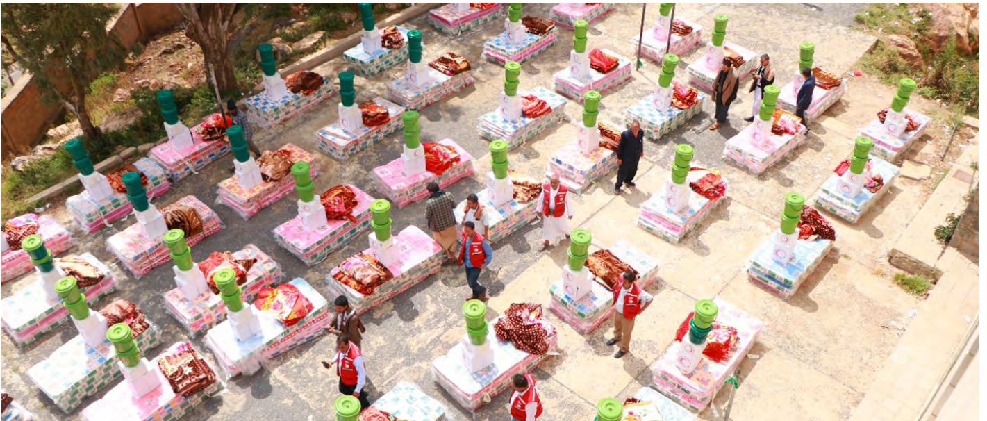
Yemen Red Crescent Society distributing non-food items for flood-affected people in Al-Mahweet governorate.

The DREF allocation of CHF 449,100 in May 2024 supported the Yemen Red Crescent Society in aiding 21,175 people affected by flooding in the week of 20th April 2024. The support included distribution of non-food kits including mattresses, blankets, kitchen sets, hygiene kits and plastic buckets to the affected communities.