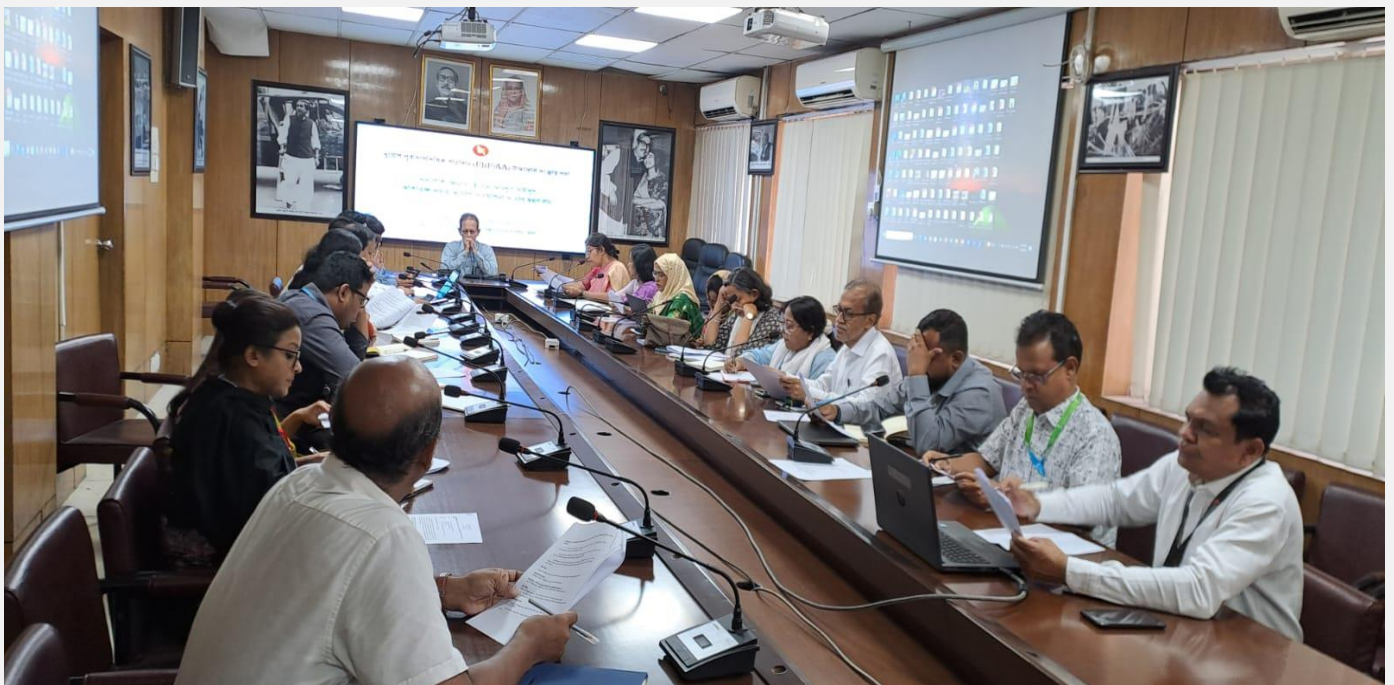
AA Taskforce convene a meeting to finalize the national harmonize EAP on flood and cyclone hazards.

Furthermore, BDRCS is hosting the AA Secretariat to enhance coordination among relevant stakeholders.