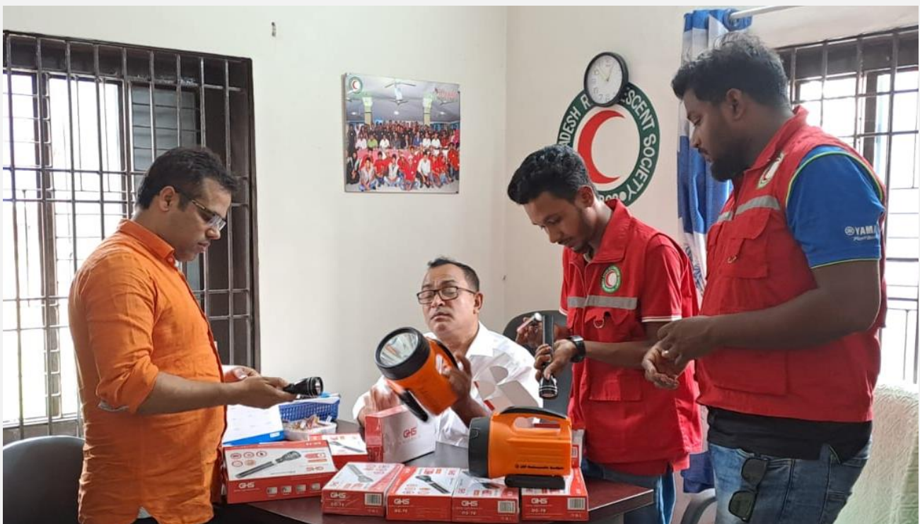
BDRCS staff and volunteers from one of cyclone prone BDRCS unit conduct routine check of pre-positioning items

BDRCS procured 40 sets of super megaphones, 50 sets of portable artificial lights for cyclone shelters, 250 units of torch lights for volunteers, 100 sets of First-Aid boxes with refill packs, 205 units of waste bins with closed lids, and 50 sets of portable handwash facilities in 2022. Subsequently, BDRCS positioned these prepositioned items at strategic locations in the 14 coastal districts in 2023. Currently, BDRCS is regularly checking and maintaining these prepositioned items.