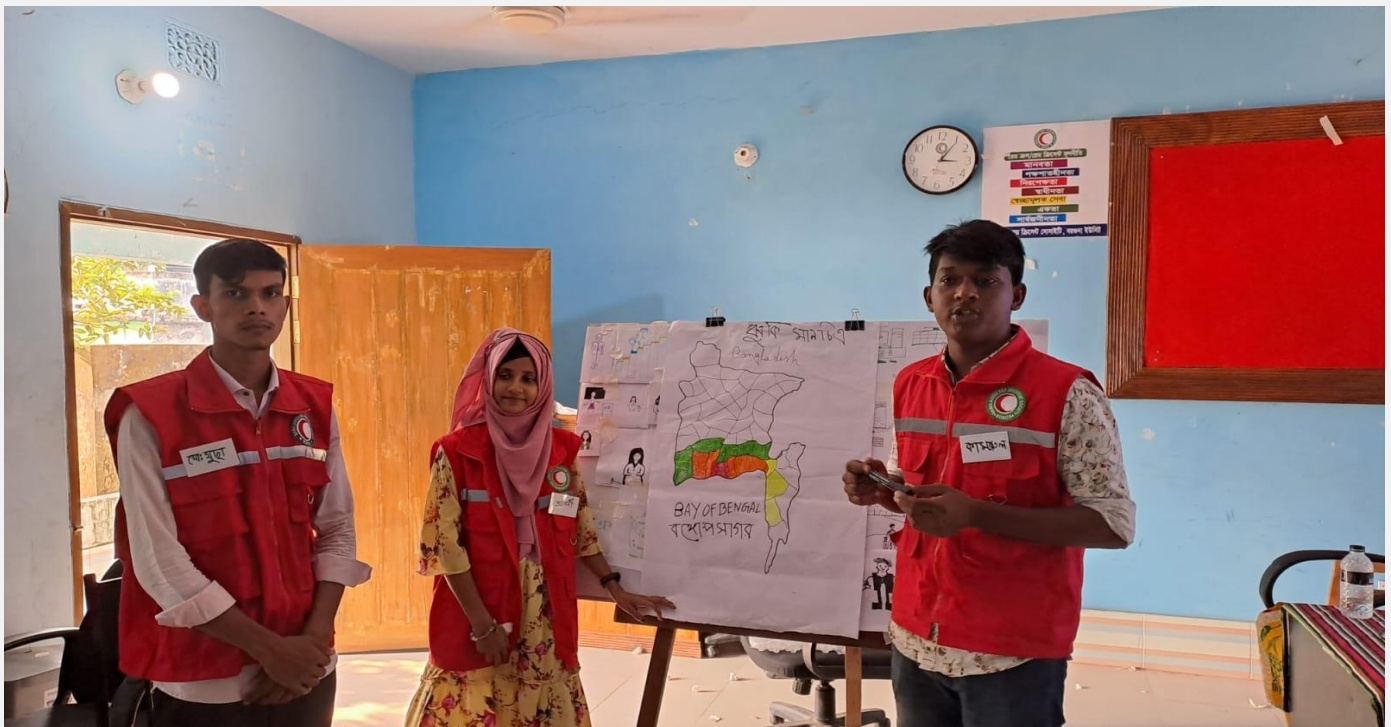
BDRCS conducts an orientation session for its volunteers on cyclone EAP and its planned activities

BDRCS now has dedicated staff providing technical support, particularly for forecast monitoring and the smooth implementation of planned activities under this EAP. Additionally, BDRCS regularly shared forecast monitoring reports with Movement partners and AA TWG members regarding Cyclone Mocha, Cyclone Hamoon, and two other depressions in the Bay of Bengal.