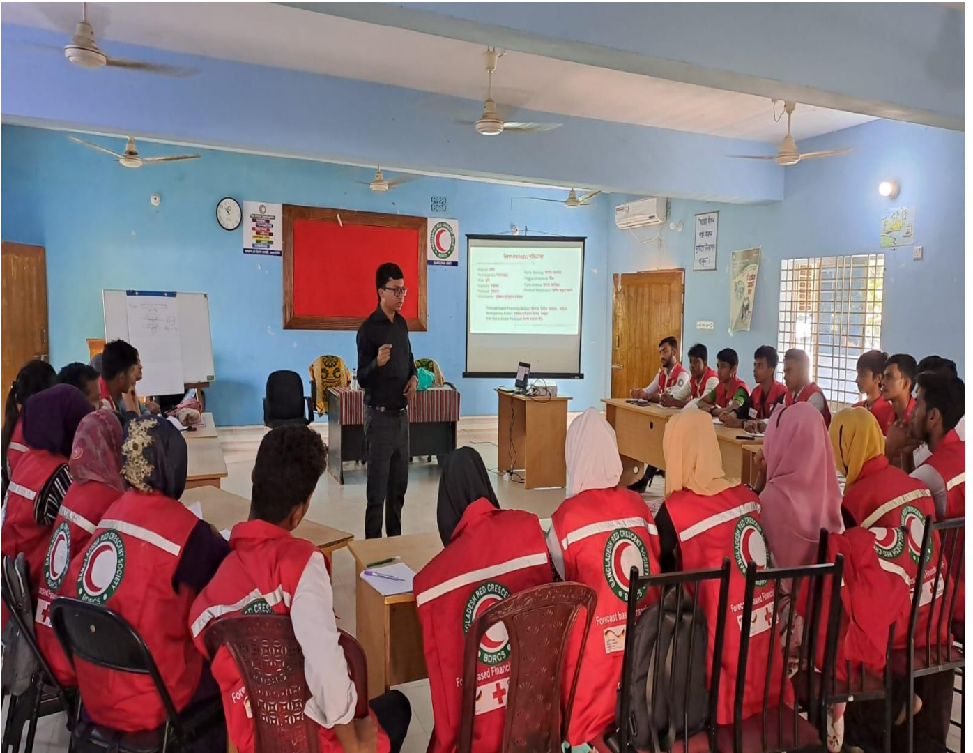
As part of readiness activities, the Bangladesh Red Crescent Society (BDRCS) conducts orientation sessions on cyclone EAP and its planned activities to Red Crescent volunteers and staff