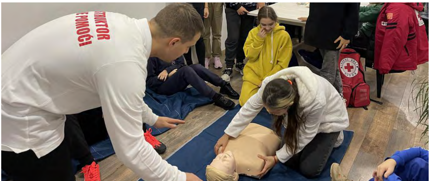
Red Cross of Montenegro volunteers conducting a first aid workshop for displaced children from Ukraine in February 2023

It also engaged young people in a competition and conducted first aid workshops, reaching 2,320 participants. Additionally,