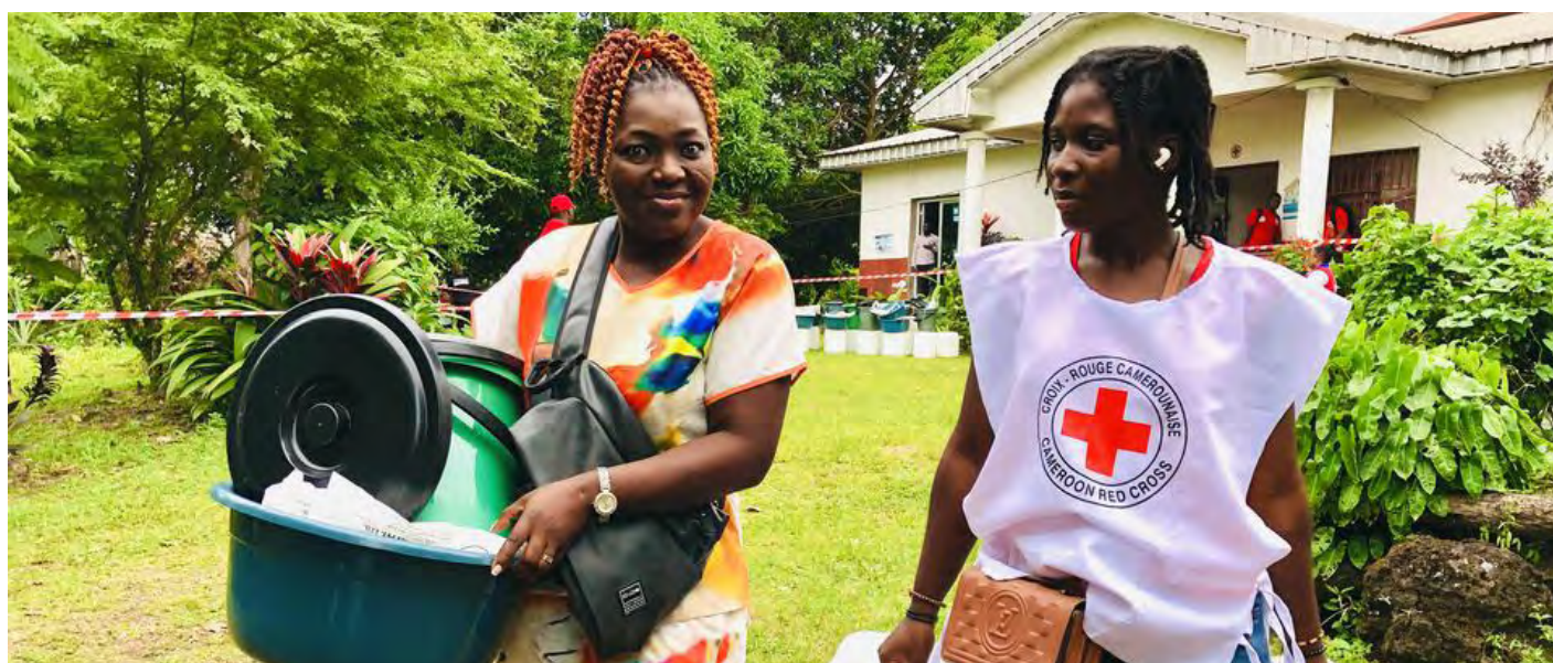
A Cameroon Red Cross Society volunteer assists a beneficiary with her non-food items package during Fako Floods distribution at Limbe, Cameroon, in December 2023

The DREF allocation of CHF 149,976 in March 2023 supported the Cameroon Red Cross Society in the early detection of suspected cases and prevention of the spread of Marburg disease, aiding 143,952 people. The support included awareness-raising sessions, mass sensitization in public places such as markets and dissemination of messages to ensure community awareness on the risks of Marburg disease and ways to prevent it. Other support comprised of the installation of hand washing facilities in high-traffic areas and reaching the targeted communities with messages focused on water, sanitation and hygiene (WASH) promotion.