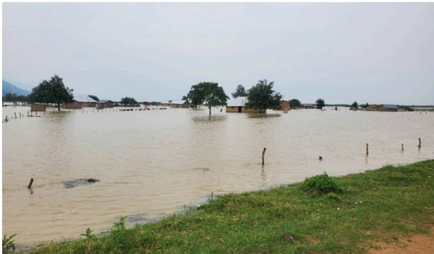
Some of the submerged houses in Bweramule sub county.