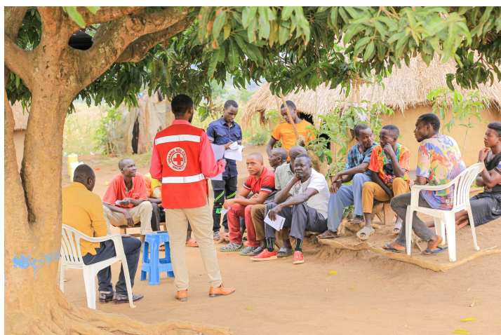
URCS volunteer conducting field assessment

The DREF operation is scheduled to conclude on 31st August 2024. However, ongoing flooding in Ntoroko District has significantly impacted the area. According to the latest needs assessment that was conducted by the District Disaster Management committee on the 7th of August and a further assessment for Ntoroko district completed and shared on 21st August, 11,775 individuals (2,355 Households) have been affected, as a result of the increased flooding bringing the total affected to 69,283 people. Based on this, URCS is requesting an additional allocation and extension of implementation timeframe from three months to six months to allow the NS respond to the increasing flooding in Ntoroko district.