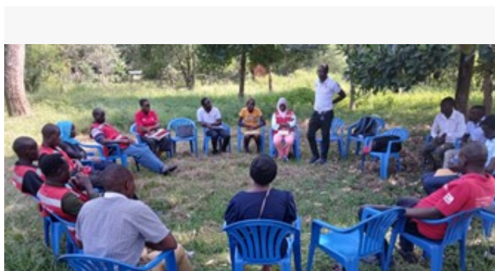
Orientation of volunteers on data collection prior to conducting a CASH feasibility assessment in Budaka District