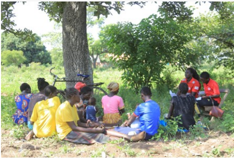
Hygiene promotion and sensitisation of beneficiaries in Bukedea District