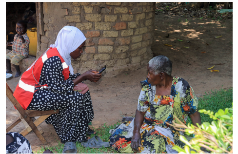
Beneficiary registration exercise for CVA