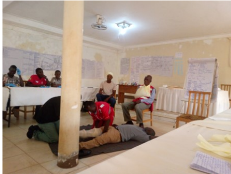
CBHFA training in Mbale city