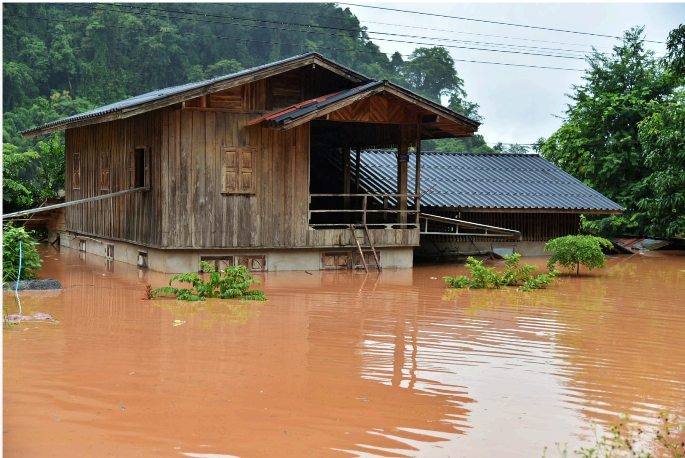
A view of a house inundated by floodwater in Xaignabouli. The surrounding area is overtaken by the flood, illustrating the impact on homes and communities in the affected areas