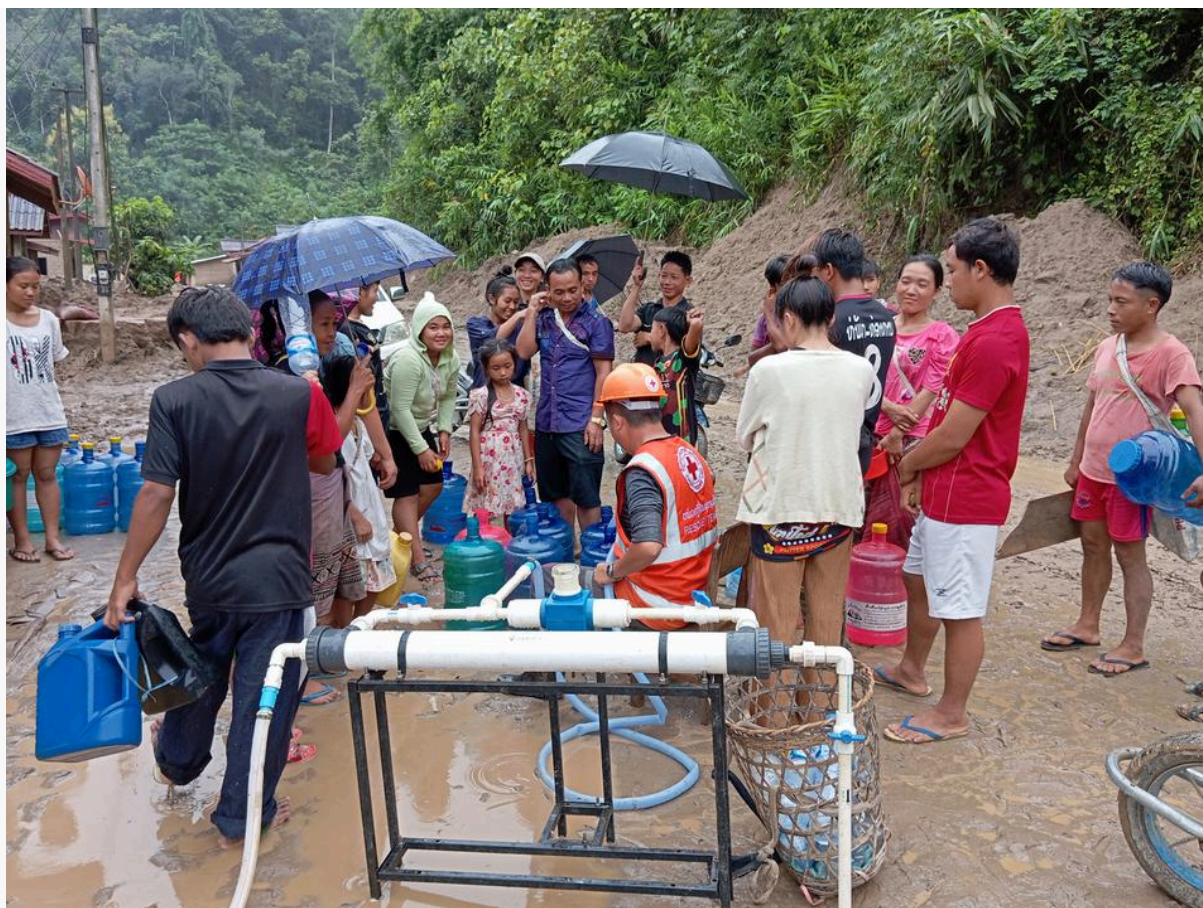
Lao Red Cross Emergency WASH team deploys mobile water filtration units to provide clean water to flood-affected communities in Luang Prabang Province

Despite ongoing efforts, additional funding is urgently needed to support response operations, particularly in Huaphan, Xiengkhuang, and Xayabouly provinces, where the need for assistance remains critical.