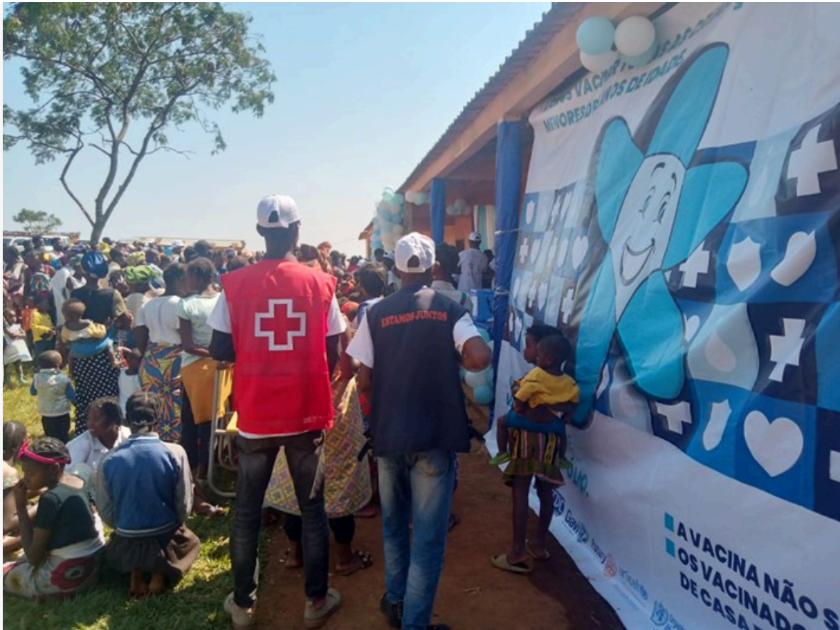
CVA Volunteers supporting Polio Vaccination Campaign May 17th, 2024