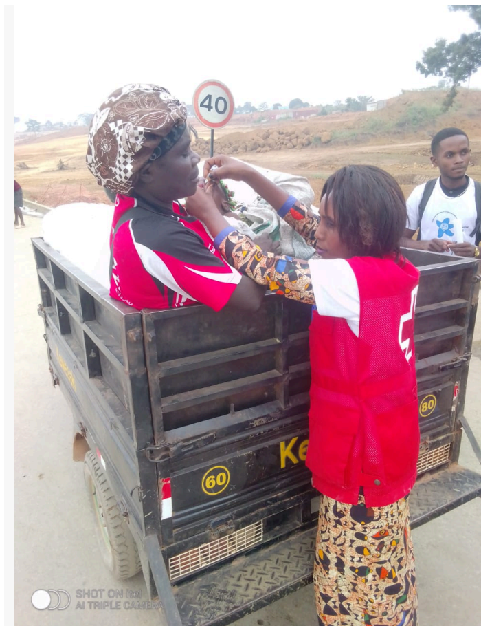
CVA volunteer vaccinating child

Recent Lot Quality Assurance Sampling (LQAS) and independent monitoring (for round 2) have shown that 3 provinces have poor coverage. These are Moxico, Cuando Cubango and Malange. The main reason is both infrastructure i.e road and community awareness, communication and engagement.