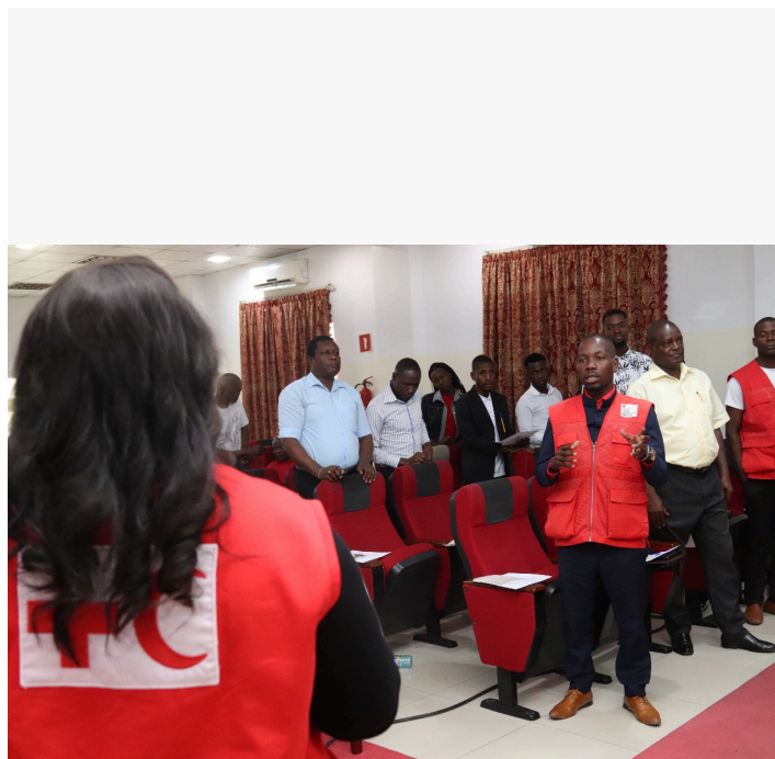
Training on health related matters carried out by CVA and IFRC