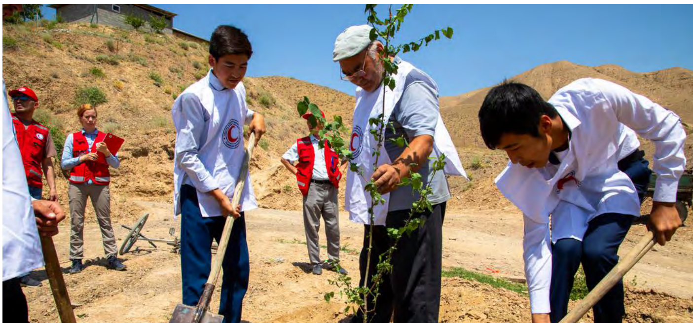
Volunteers of Red Crescent Society of Tajikistan planting trees to help prevent mudslides.

within Tajikistan while concurrently promoting the principles of IHL. By synergizing emergency preparedness efforts with IHL promotion, this project not only enhances Tajikistan's ability to respond effectively to crises but also reinforces a culture of respect for humanitarian norms and values, thereby contributing to the protection of human dignity and the alleviation of suffering in times of adversity.