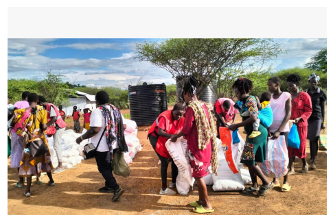
Food Distribution in Baringo