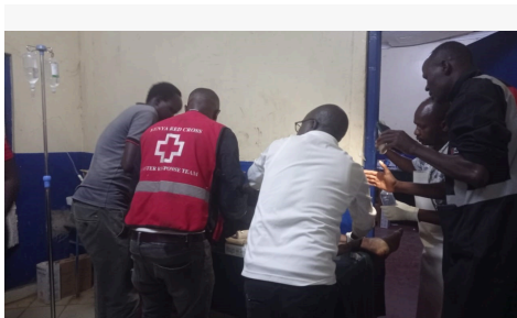
KRCS support with medical evacuation to an injured community member