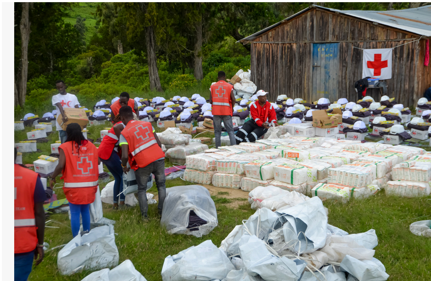
In Kind Food and Emergency Shelter Items Distribution in Samburu North