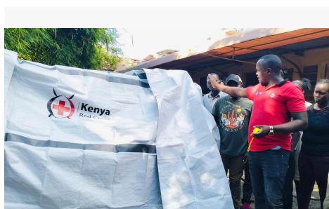
Emergency shelter demonstration in Baringo