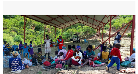
KRCS conducts a medical outreach to affected communities