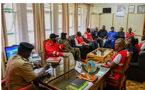
A courtesy call to the County Commissioner by the SG in Baringo county