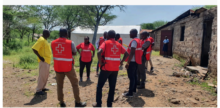
Assessment of a burnt Shool just before the re-opening for term twohool