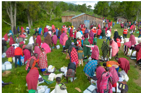
In-Kind food and NFI distribution in Samburu County