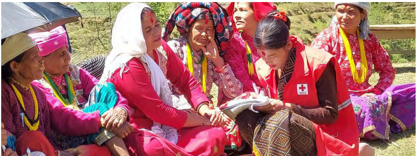
Nepal Red Cross volunteer interacts with community people to provide health-related information in Doti.

The IFRC has supported the Nepal Red Cross Society to enhance emergency response capabilities and address health crises nationwide. IFRC's swift approval of a DREF supplemented by additional funding from British Red Cross, Canadian Red Cross, Danish Red Cross, and Swiss Red Cross , enabled Nepal Red Cross Society to launch a large-scale risk communication and sanitation campaign across 26 districts, reaching 777,625 individuals. Additionally, the National Society has initiated Community-based surveillance in Baglung district with support from Canadian Red Cross and IFRC, aiming to strengthen Nepal's surveillance systems.