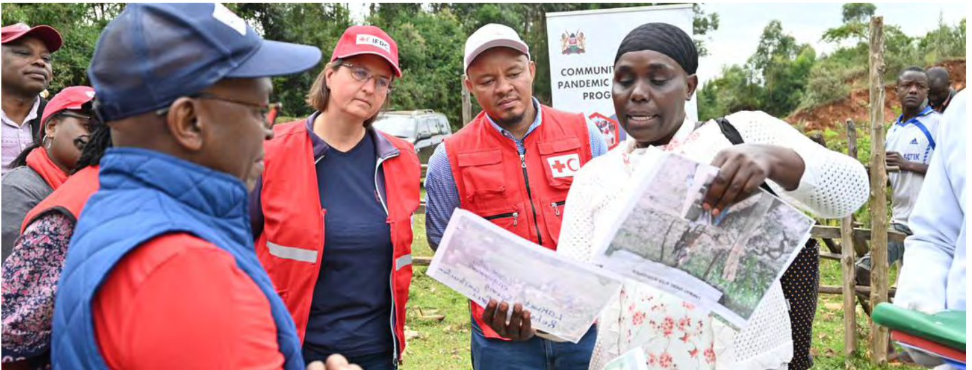
Kenya Red Cross team implementing the USAID-supported Community Epidemic and Pandemic Preparedness (CP3) program in rural Kenya, in October 2023