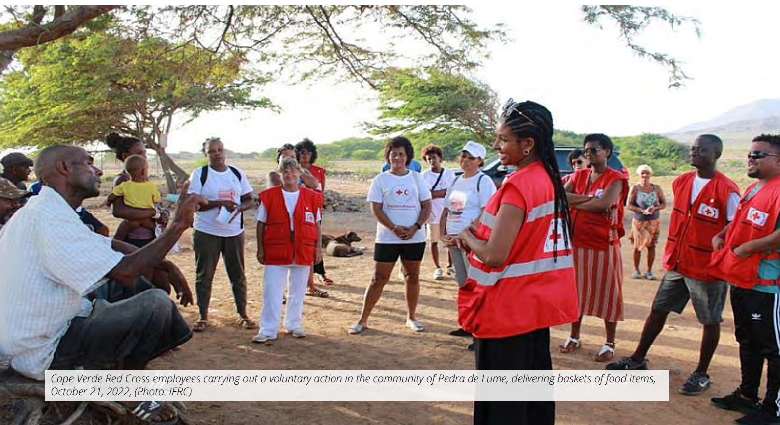
Cape Verde Red Cross employees carrying out a voluntary action in the community of Pedra de Lume, delivering baskets of food items, October 21, 2022, (Photo: IFRC)

Humanitarian needs for migrants and internally displaced persons (IDPs) in Cape Verde range from emergency assistance in health, water, sanitation, hygiene, and nutrition to protection and longer-term needs related to livelihoods, education, social integration, and durable solutions. The COVID-19 pandemic highlighted vulnerabilities, with migrants facing difficulties accessing information and services due to legal status, language barriers, and social stigma.