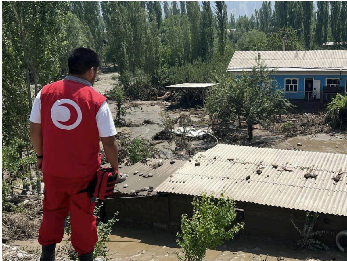
Floods in April and June 2024 have caused extensive damage.