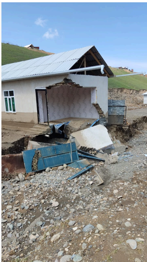
The mudflows have extensively damaged or destroyed houses.

According to the Hydrometeorological Service under the Ministry of Emergency Situations (MoES), in the period from 26 to 28 April 2024, forecasted unstable weather and expected local torrential rains, as well as possible floods in the mountainous and foothill areas of the country, the rivers are expected to rise in water levels. On 22 April, state of emergency was declared in three provinces: Osh, Jalal-Abad, and Talas.