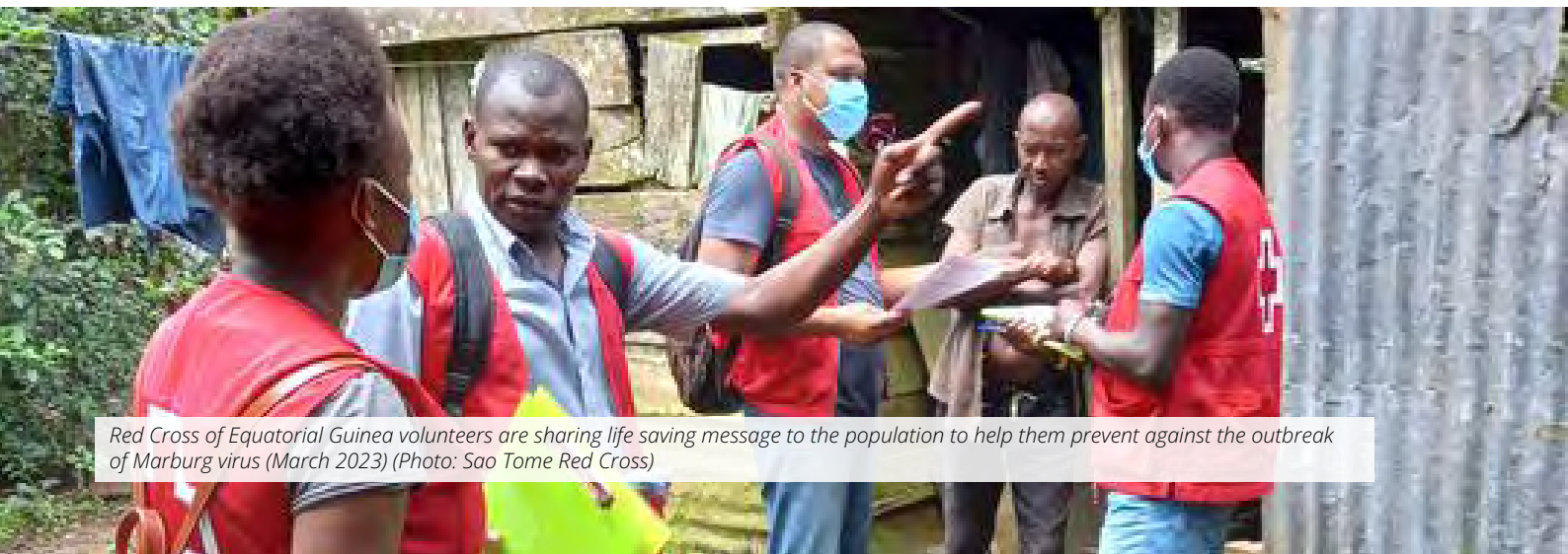
Red Cross of Equatorial Guinea volunteers are sharing life saving message to the population to help them prevent against the outbreak of Marburg virus (March 2023)

The National Society aims to increase the resilience of communities to disasters through community risk information, developing contingency plans, and training staff and volunteers, particularly in enhanced vulnerability and capacity assessment ( EVCA ). Through these interventions, the community will be better prepared for timely and effective mitigation, response and recovery to crises and disasters, which includes early action. The National Society will also carry out readiness and pre-positioning activities by establishing early action protocol and training community early warning early action groups on their roles and responsibilities jointly with other stakeholders.