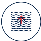
Sea level rise