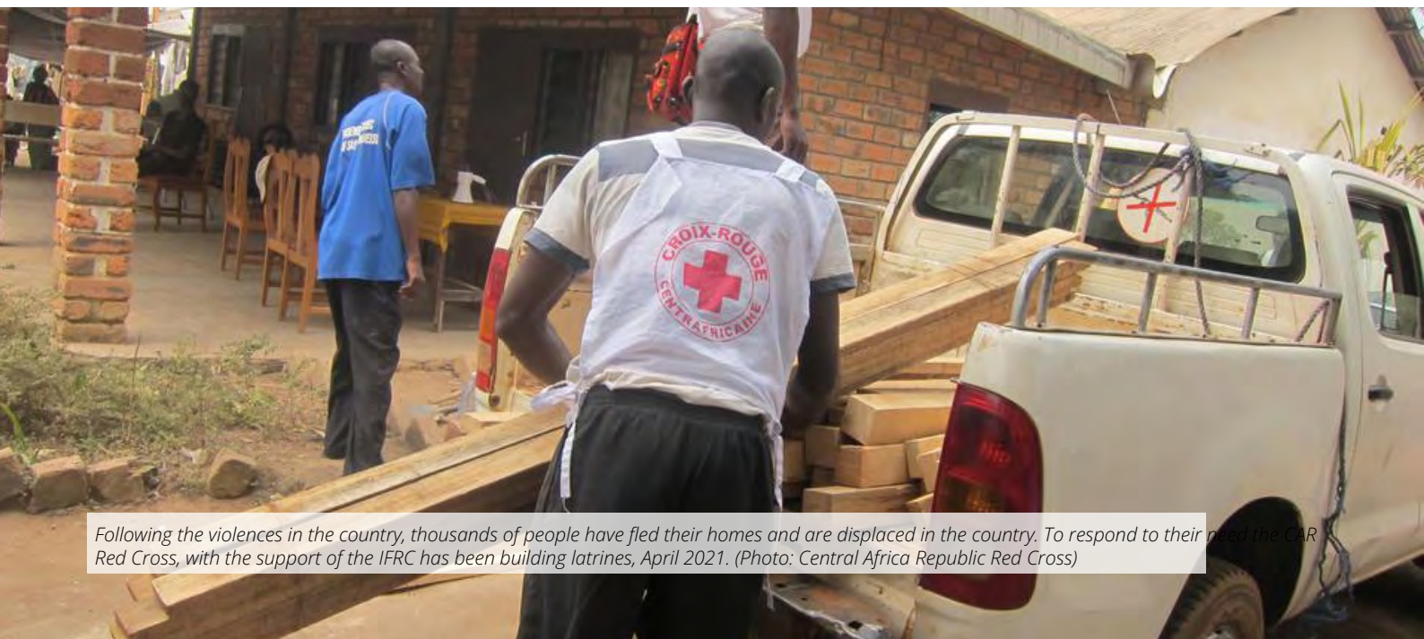
Following the violence in the country, thousands of people have fled their homes and are displaced in the country. To respond to their need the CAR Red Cross, with the support of the IFRC has been building latrines, April 2021.

The Netherlands Red Cross supports the National Society in youth empowerment and peacebuilding, and the institutionalization of community engagement and accountability (CEA).