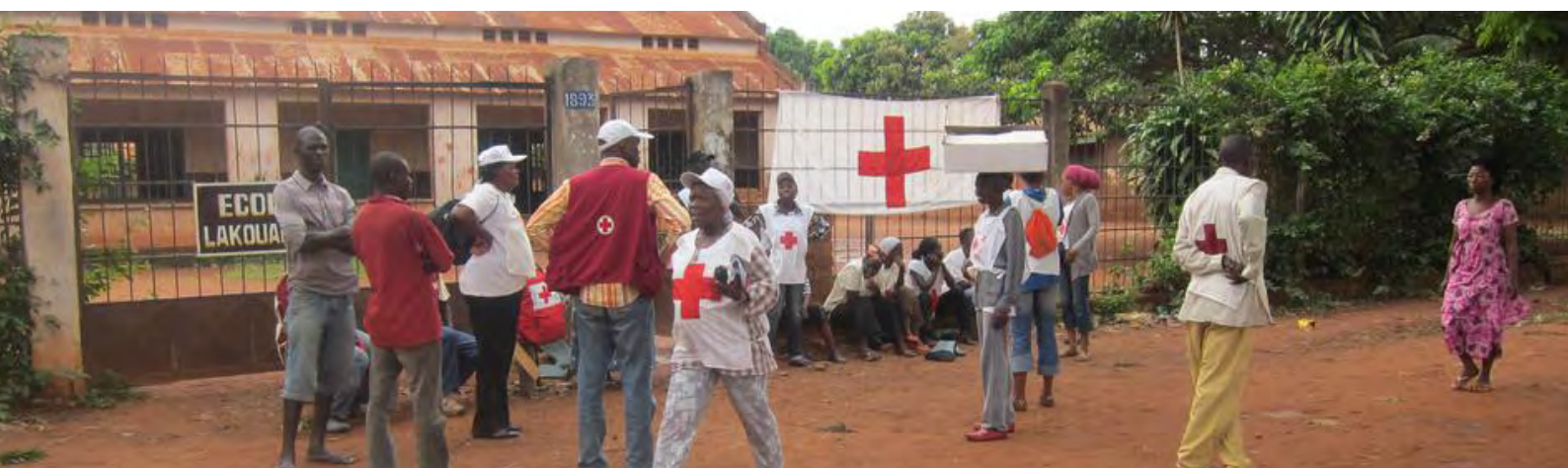
Following the violence in the country the CAR Red Cross is providing first aid activities, helping the wounded and referring them to the hospital when there is one functioning, April 2021.

The Central African Red Cross Society aims to take urgent action to adapt to the growing and evolving risks of the climate and environmental crises. It will strive to integrate the objectives set out in international, regional and national policies and plans on the management of the effects of climate change such as the 2015 Paris Agreement; Stockholm Convention on Persistent Organic Pollutants; Bamako Convention on the Prohibition of