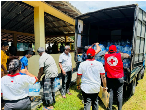
SLRCS distributes drinking water bottles at the safe centers.