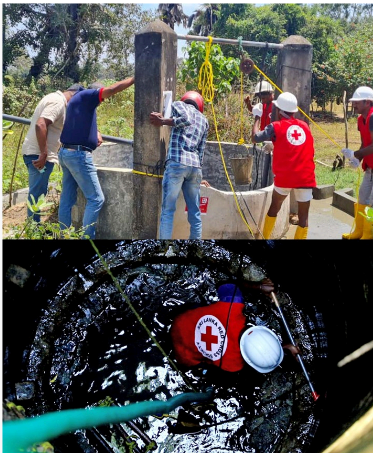
Volunteers from the SLRCS Mullaitivu branch cleaned the individual dug wells, helping people access pure drinking water.