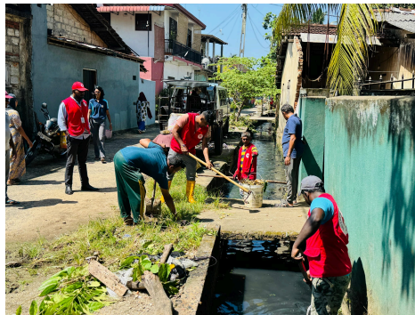
SLRCS engages in community clean up campaigns.