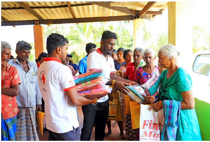
SLRCS branch volunteers distributing essential household items to flood-affected people.