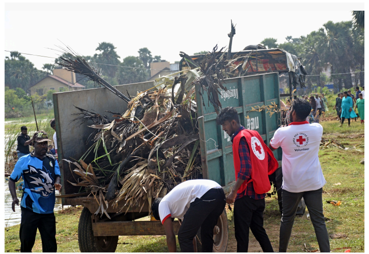
SLRCS engages in community clean up campaigns.