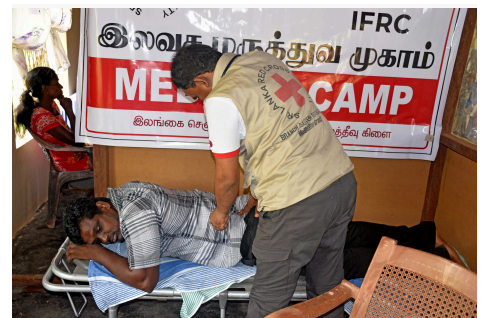
SLRCS organizes medical camps to treat the emergency health needs of flood-affected people.