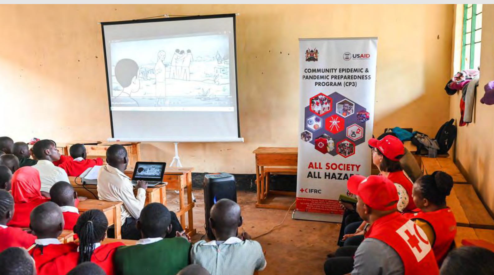
Kenya Red Cross volunteers conducting a community epidemic and pandemic preparedness programme, in July 2023

Cross-cutting approaches: the operational strategy integrates community engagement and accountability (CEA) and protection, gender and inclusion (PGI) as pivotal elements, in an approach that recognizes and values all community members as equal partners, with their diverse needs shaping the response. Activities includes the provision of dignity kits, and establishment of two-way feedback mechanisms. The strategy emphasizes local voice amplification, collaborative engagement, and transparent communication, extending into long-term resilience building through initiatives such as the IFRC Pan-Africa Zero Hunger Initiative.