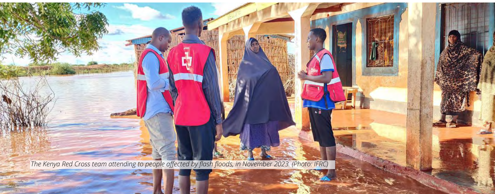
The Kenya Red Cross team attending to people affected by flash floods, in November 2023.

The Norwegian Red Cross supports health, water, sanitation and hygiene.