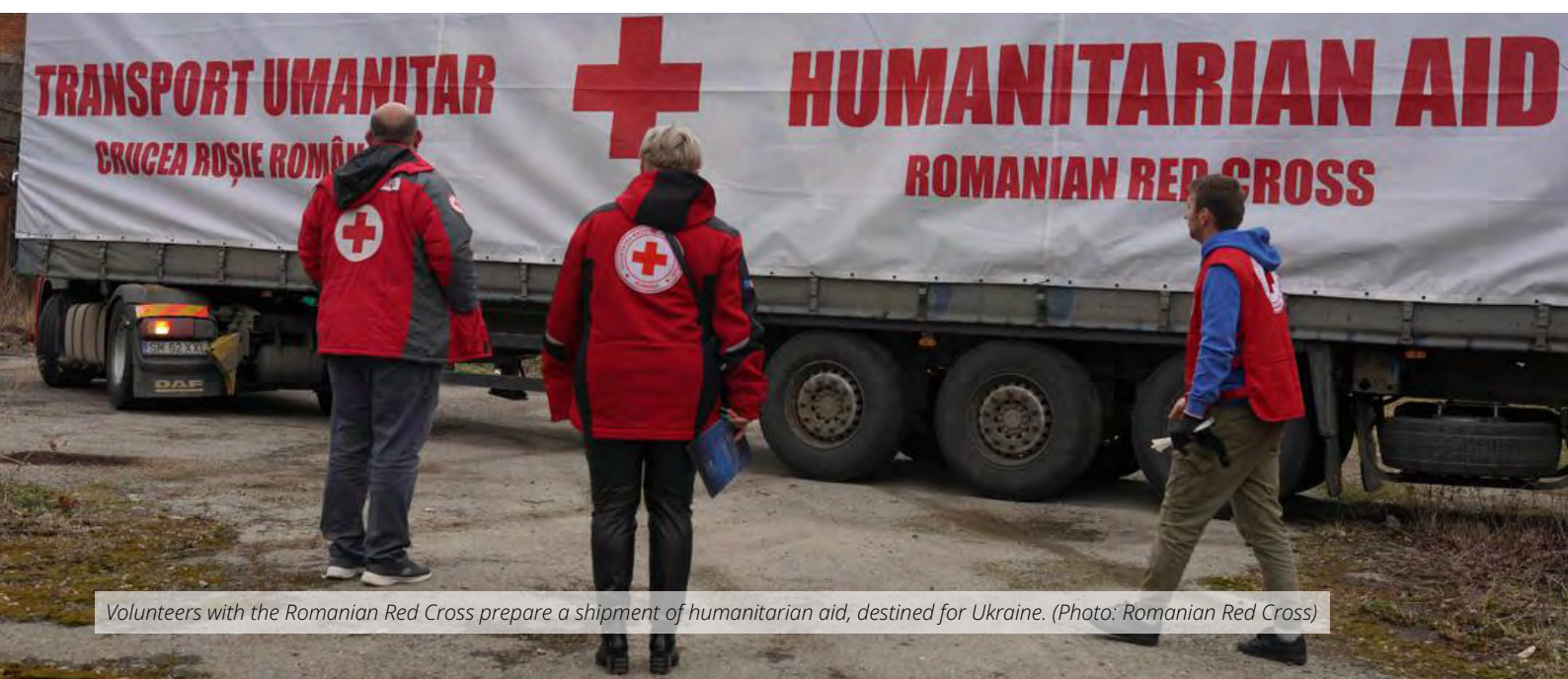
Volunteers with the Romanian Red Cross prepare a shipment of humanitarian aid, destined for Ukraine.