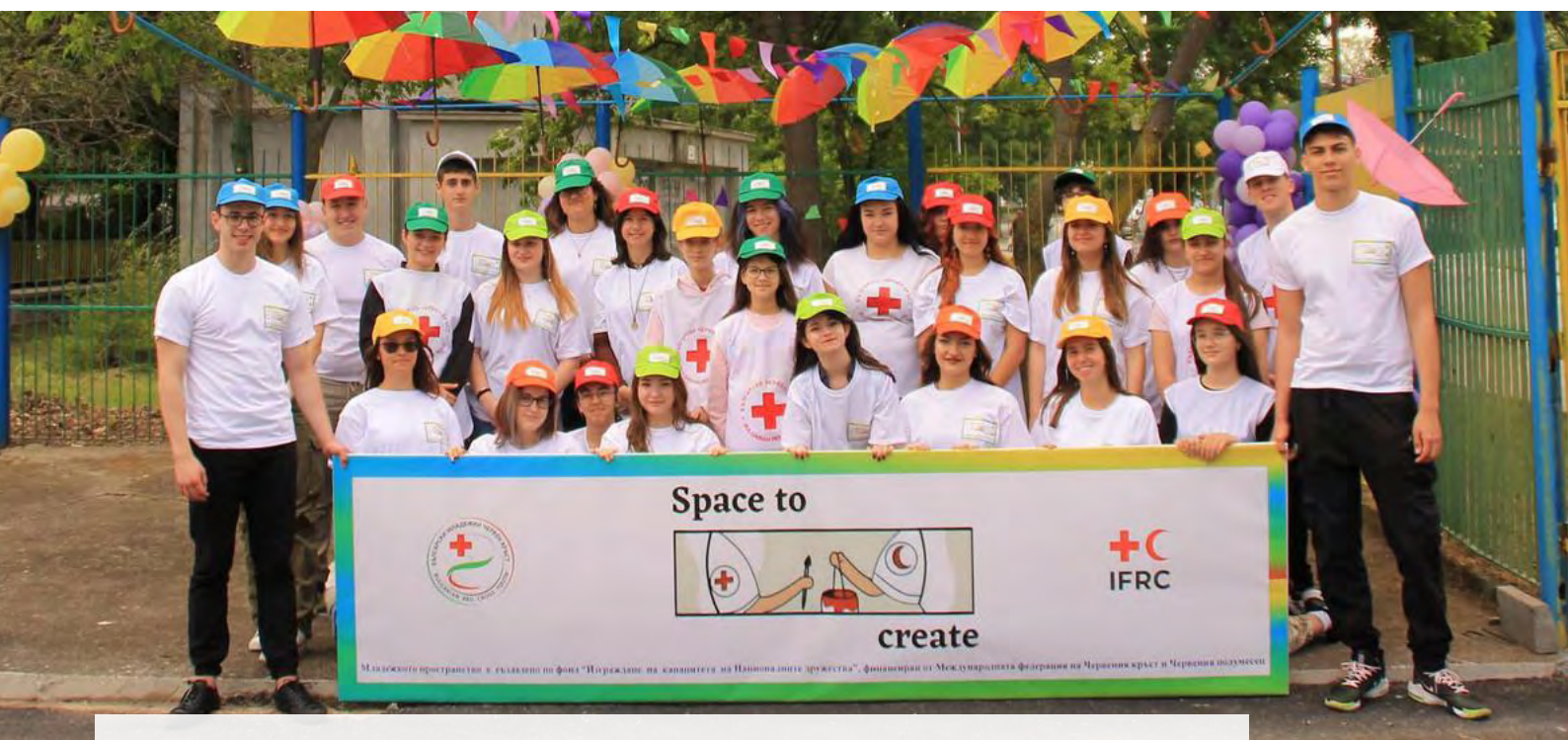
Staff and volunteers participate in photo collection for Capacity Building Fund in February 2024.

The IFRC aids the Bulgarian Red Cross through emergency appeals and the Disaster Relief Emergency Fund (DREF) , addressing disasters and crises and assisting individuals displaced by the conflict in Ukraine.