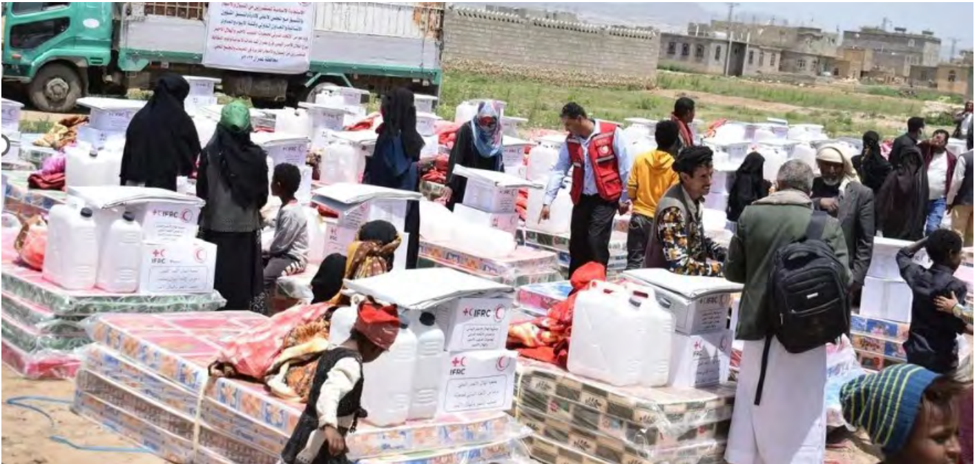
Distribution of non-food items in flood-affected communities in the Raydah-Amran Governorate.

To further strengthen the Yemen Red Crescent's capacity in cash and voucher assistance (CVA), training in CVA tools, implementation and referral systems was conducted for 21 volunteers in Abyan, Amran, Hajjah, Lahj, Sana'a and Shabwah.