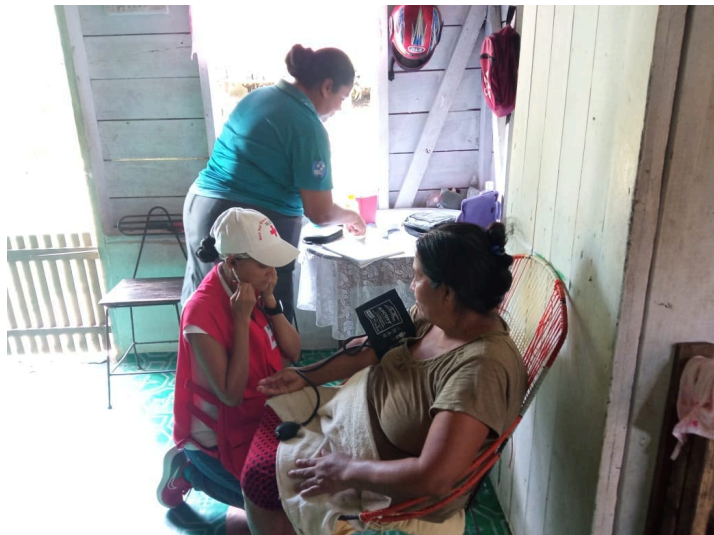
BRCS volunteer provide first aid to villagers of San Antonio affected by wildfires.

As of May 30, fires in the Toledo District continued to flare up and progress into the night due to strong winds within the area.