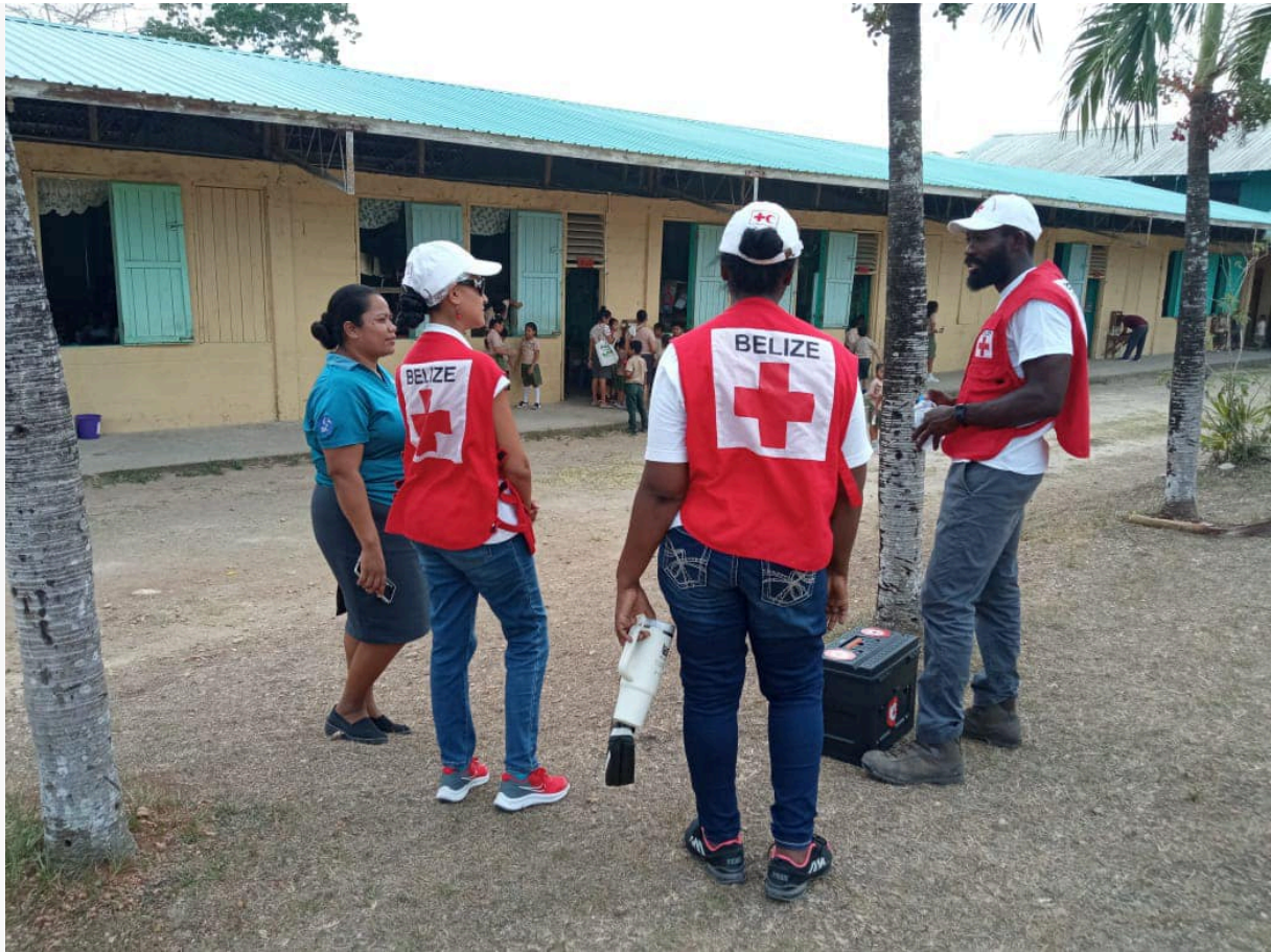
BRC staff and volunteers continue providing useful information on heat, fires, smoke and the importance of staying hydrated to villagers and students affected by wildfires in Toledo.