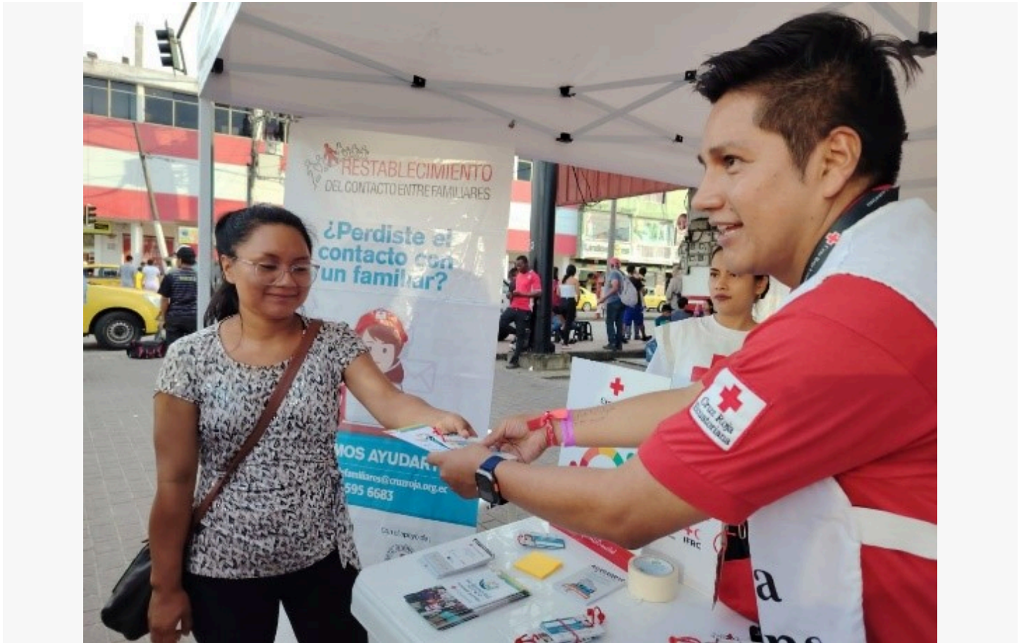
Awareness-raising on restoring family links, Napo province. February 2024.