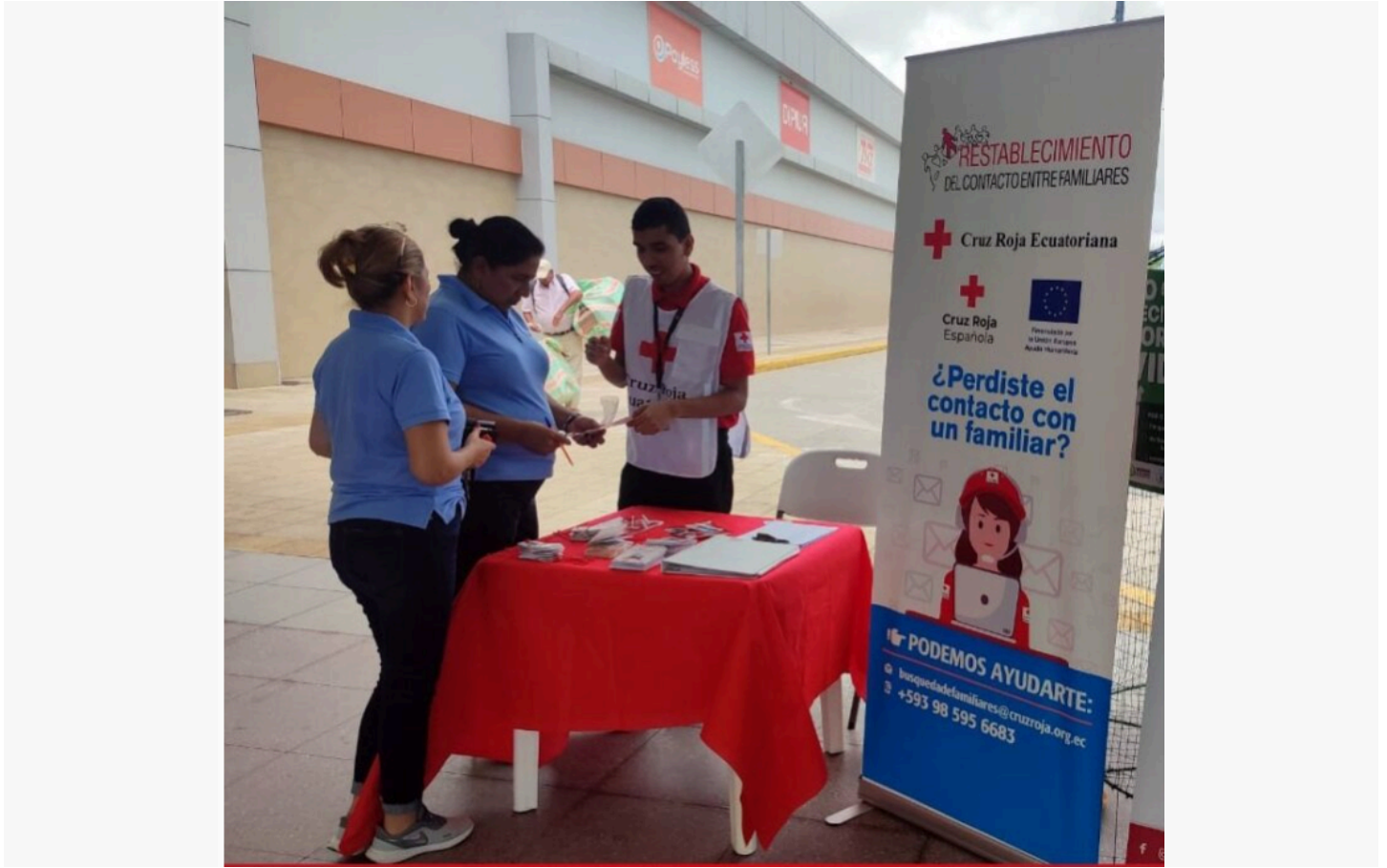
Restoring Family Links sensitization, El Oro, April 2024.

On 22 May, the government issued Executive Decree N°275, which declared a state of emergency on the grounds of internal armed conflict, for a period of 60 days, exclusively in the provinces of Guayas, El Oro, Santa Elena, Manabí, Sucumbíos, Orellana, Los Ríos and the canton of Camilo Ponce Enríquez in the province of Azuay.