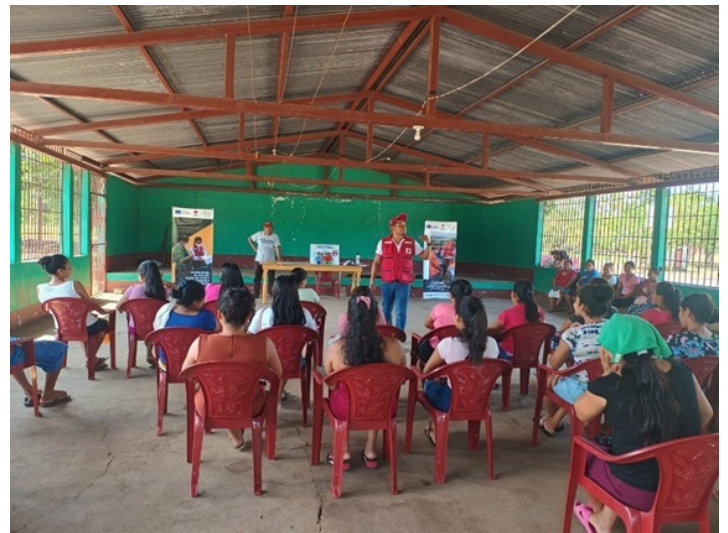
Educational sessions to share dengue prevention messages in the department of Suchitepéquez.