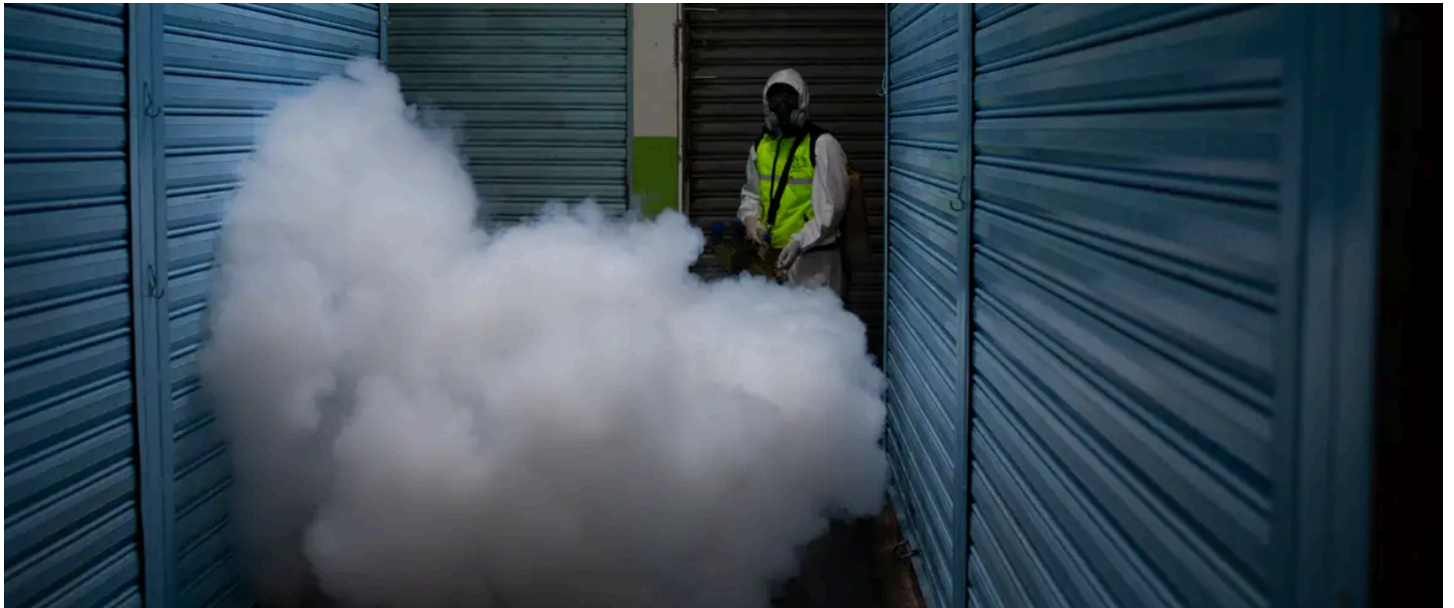
The Government has called for coordinated actions such as fumigation campaigns against the mosquito that transmits dengue.