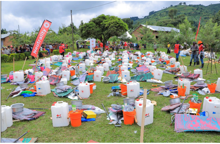
Response by the ECHO-PPP Project in Bunyangabu district on 09th May 2024