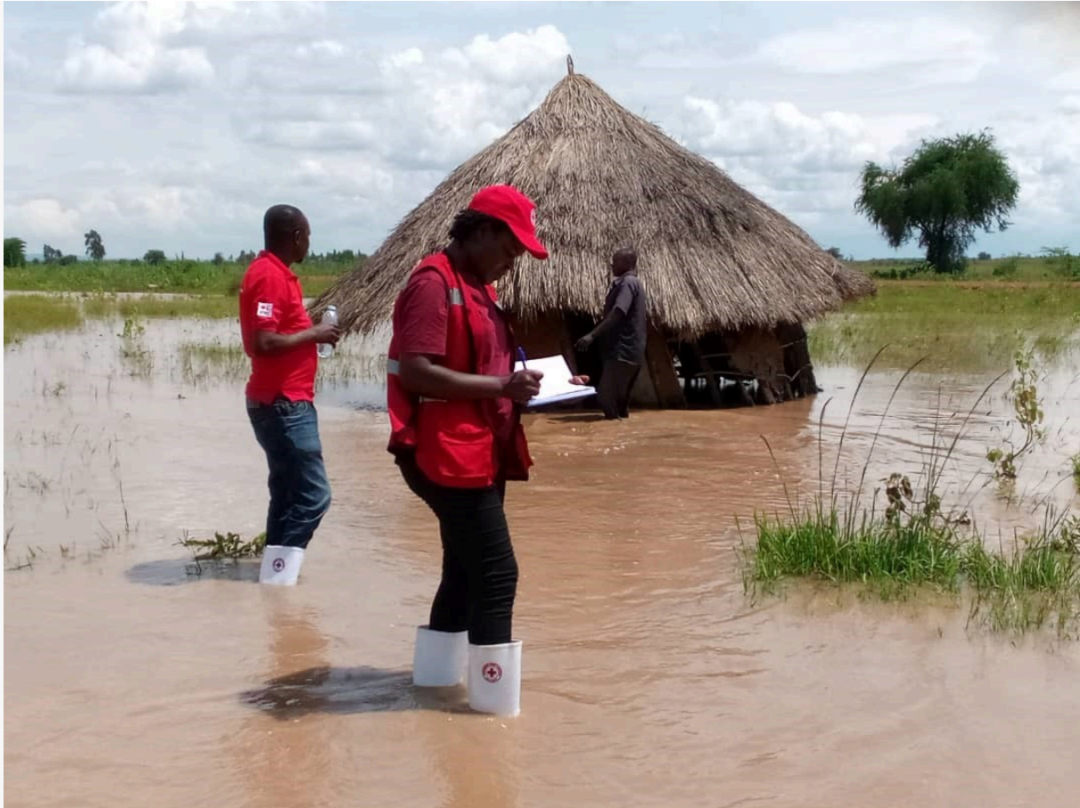
Uganda Red Cross volunteer undertaking assessments, Photo credit: Uganda Red Cross Society