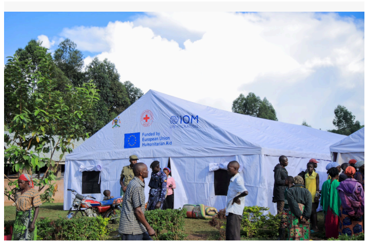
Shelter tents deployed in Bunyangabu district