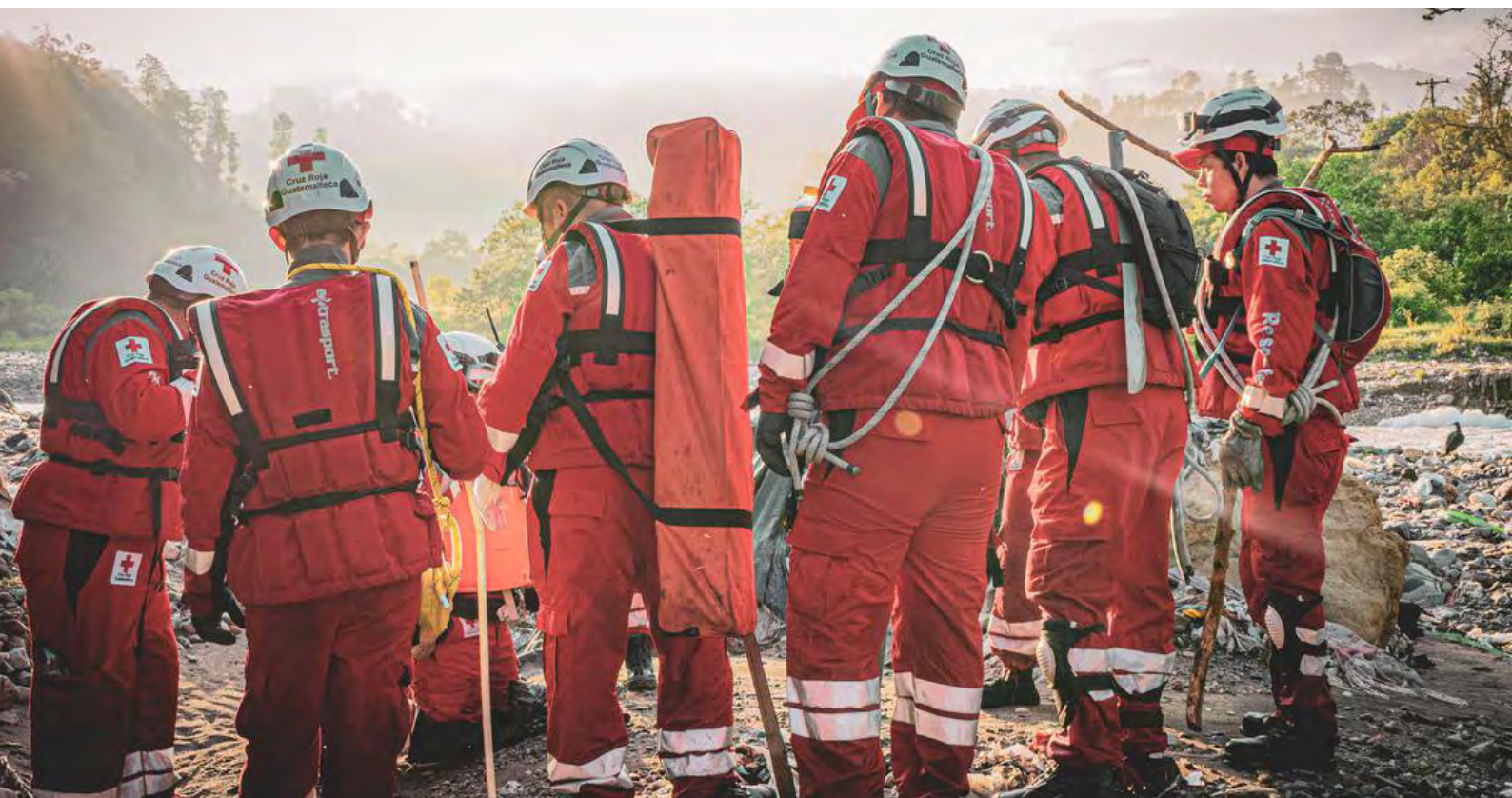
A flood reportedly swept away homes and families in the Dios es Fiel settlement. The Guatemalan Red Cross mobilized the rescue team and medical care personnel, as well as mental health and psychosocial support services, to provide care to the affected families.

The ICRC contributes to the National Society's work in protection, including minimum standards, restoring family links, self-care messages for migrants, health and first aid, and supporting the National Society in humanitarian diplomacy. The ICRC also specifically supports the Guatemalan Red Cross in health, WASH, and education.