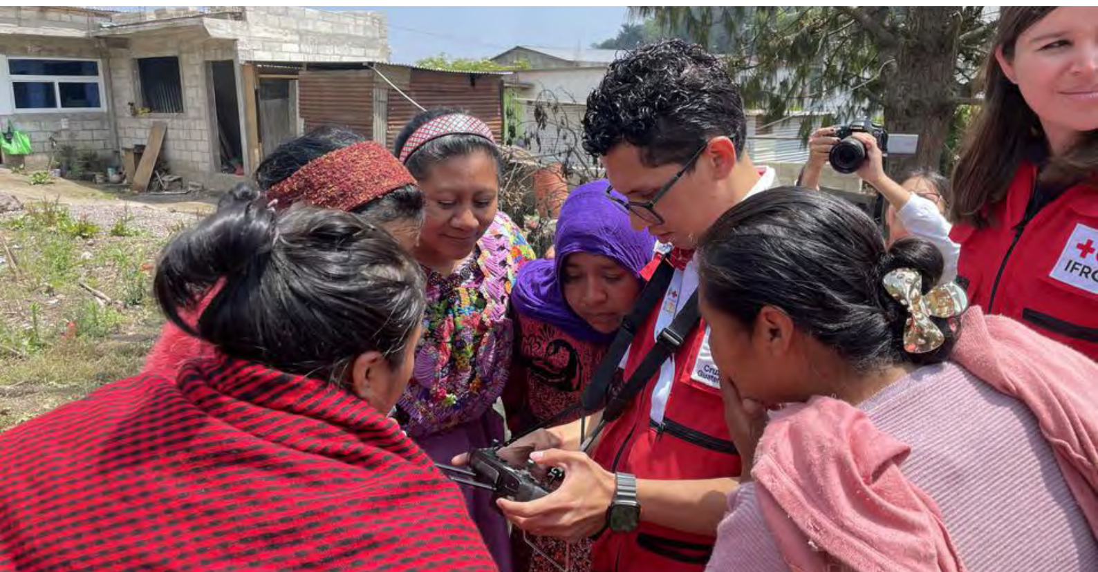
Under the Pillar of Prevention of Pandemics and Epidemics, groups of women have been trained to disseminate information in their communities about good health practices, WASH, nutrition, prevention of COVID-19 and other epidemics

The German Red Cross currently collaborates with the Guatemalan Red Cross at the national level, in the adaptation and implementation of anticipatory action mechanisms.