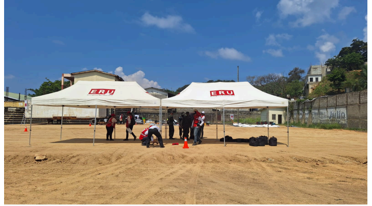
Honduran Red Cross the assembly of the Technical Health Response Unit (ERU) begins at the "Julio Galindo" stadium in Islas De La Bahía, with the joint support of FFAAHN.