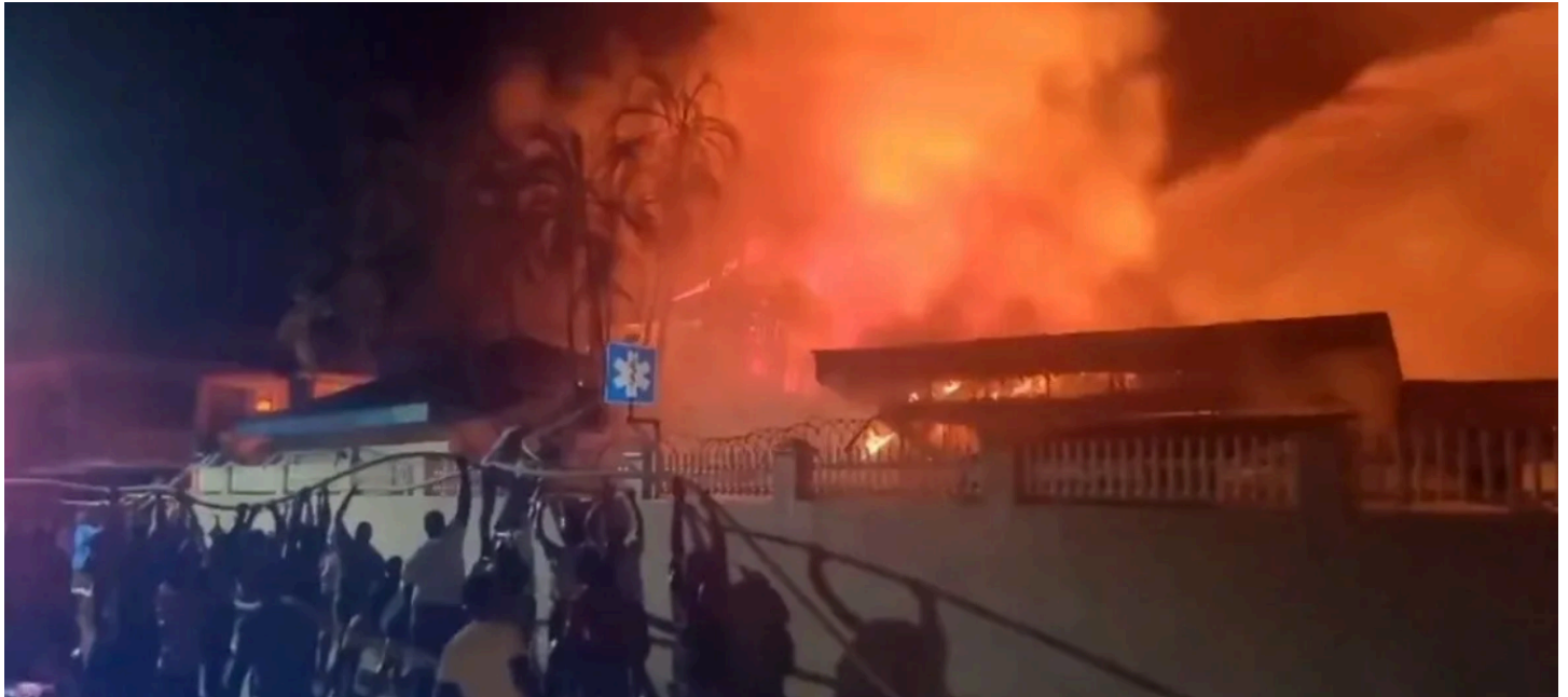
Fire at the public hospital in Roatan.