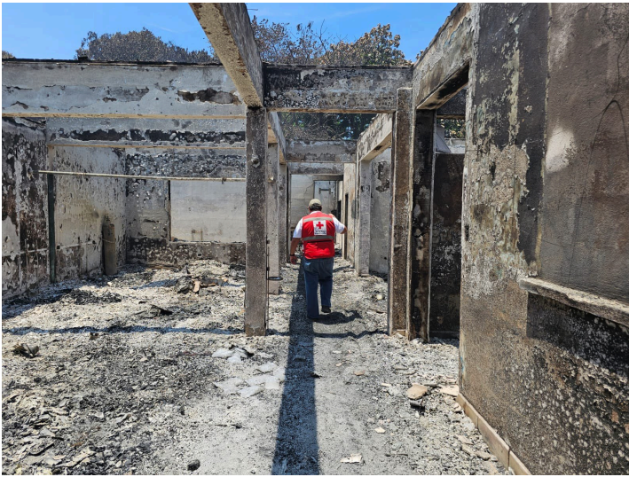
Honduran Red Cross staff tours the hospital facilities, 21 April 2024.