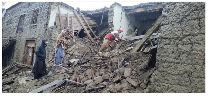
ARCS staff involving in search as rescue activities in the affected areas.