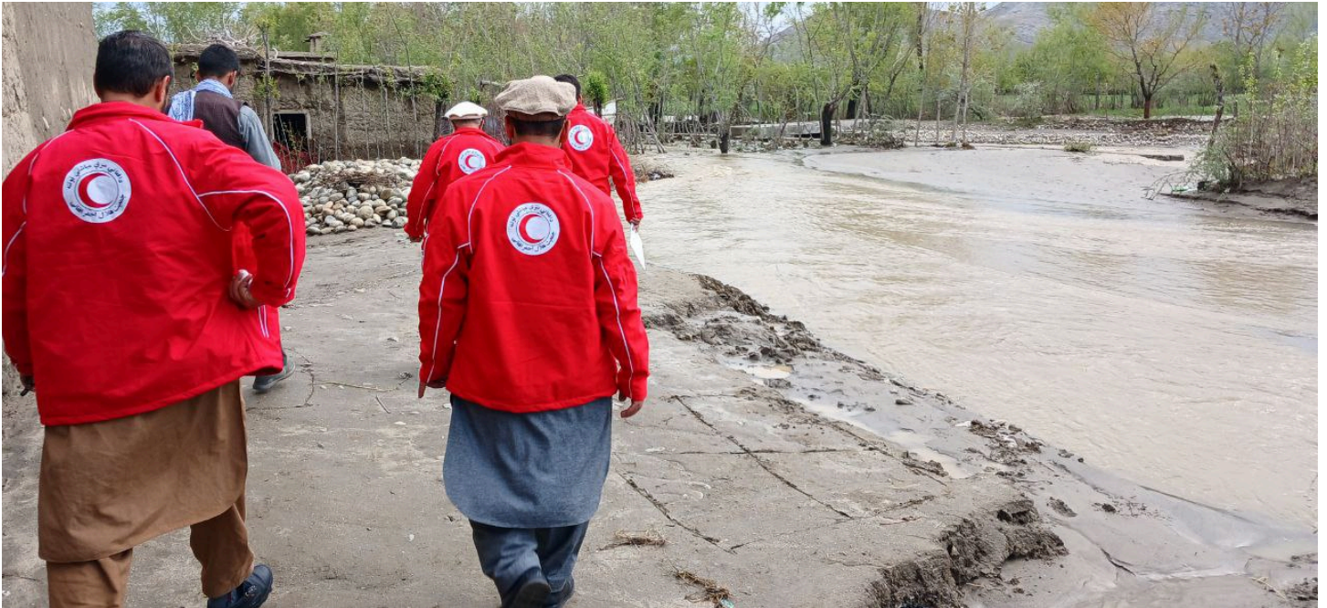
ARCS staff and volunteers carrying out assessment in areas affected by floods.