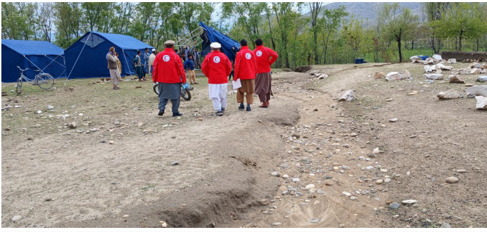
ARCS on the ground, carrying out rapid assessments and providing relief aid in the affected areas.