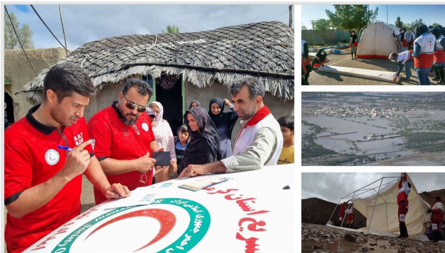
IRCS' SAR teams responding to the flood affected population