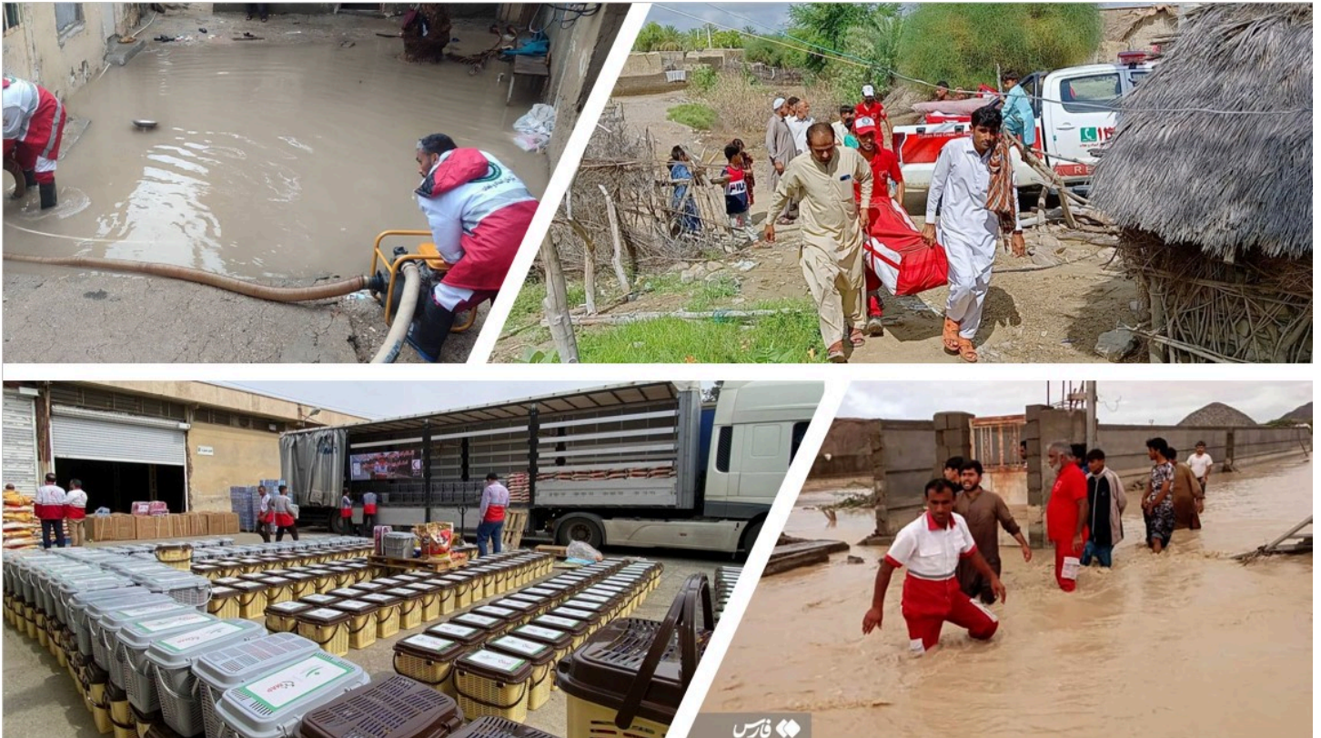
@Iranian_RCS SAR Teams & Volunteers Responding to the flood affected villages across Sistan & Baluchestan province