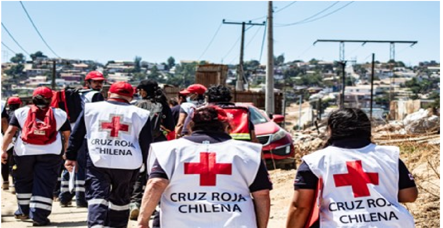
Support of the Chilean Red Cross in the emergency operation in the community of Achupallas, in the commune of Viña del Mar.