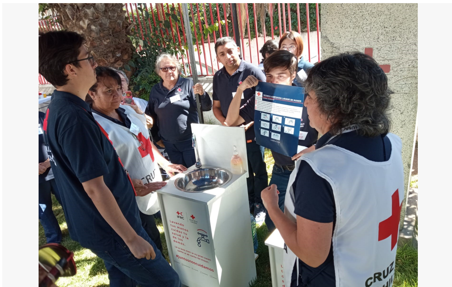
Water, Sanitation and Hygiene Training held on March 16.

At the end of this plan, all fire outbreaks were extinguished. Yet, despite this, the authorities are still monitoring the situation because there is a high probability that new ones will appear.